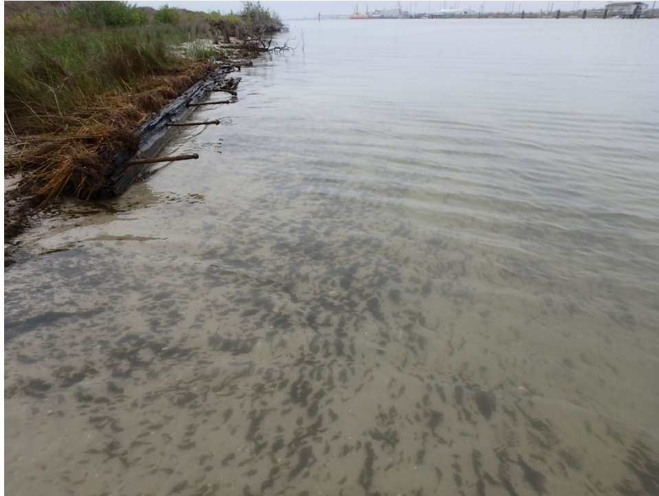
Representative E1AB – Halodule wrightii Covered in Algae