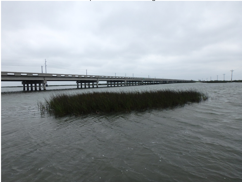
Representative E2EM (Estuarine, Intertidal, Emergent)