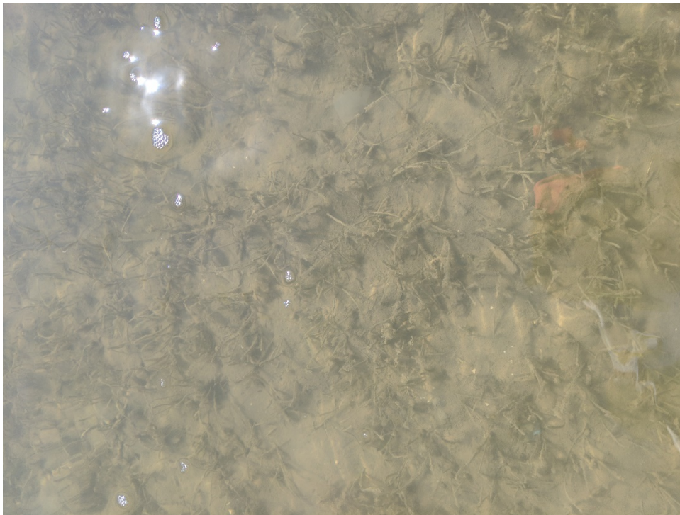
Representative E1AB (Estuarine, Subtidal, Aquatic Bed)