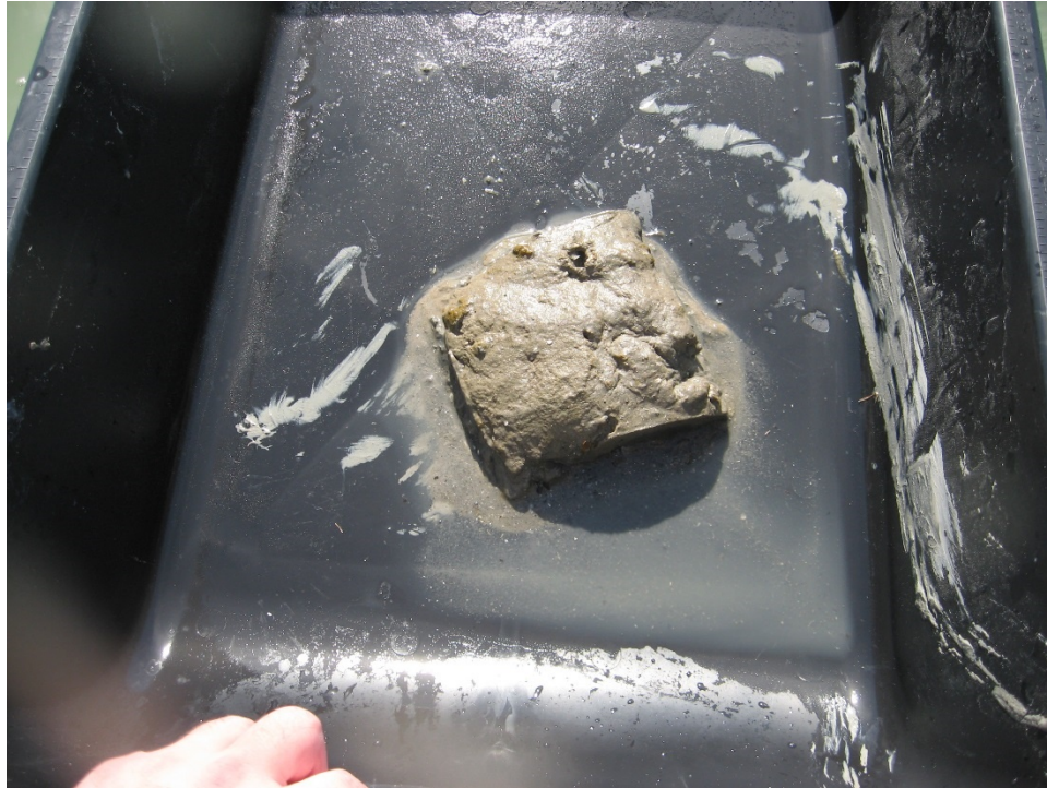
Representative Moderately Firm Mud or Sand – with Ekman Grab