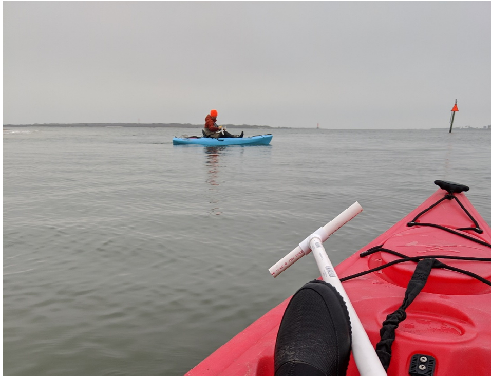
Substrate Poling Survey from Kayak