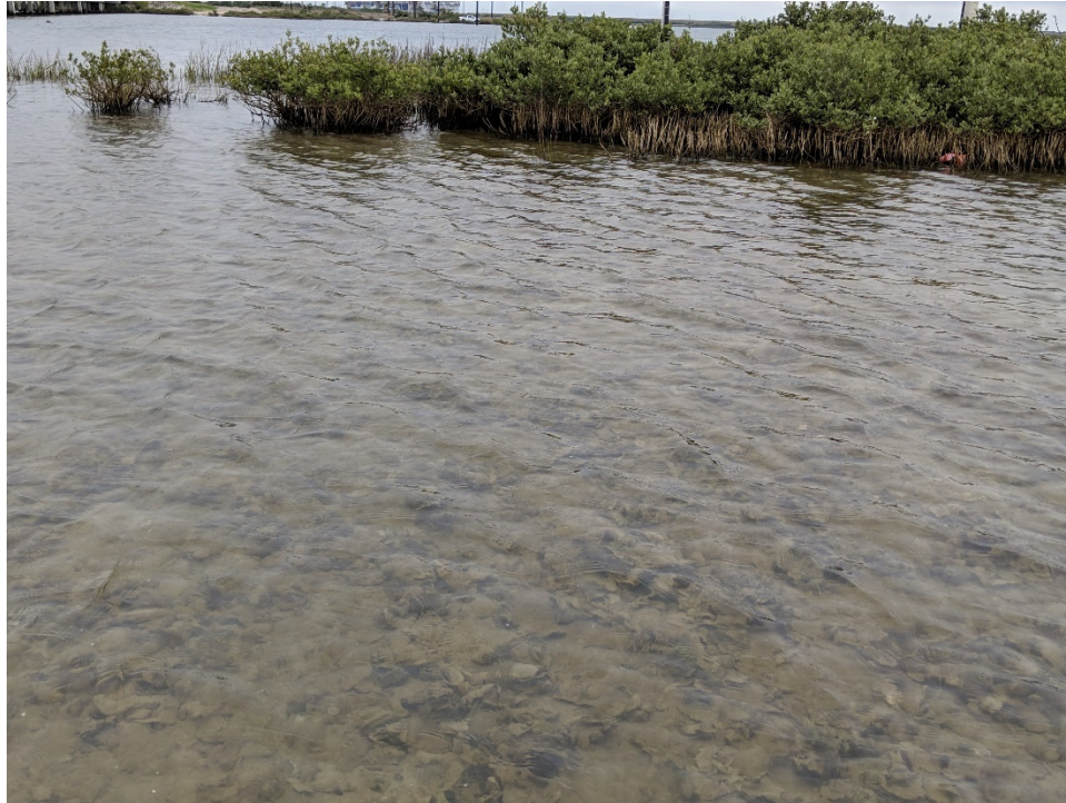
Representative E2RF (Estuarine, Intertidal, Reef) Oyster Bed