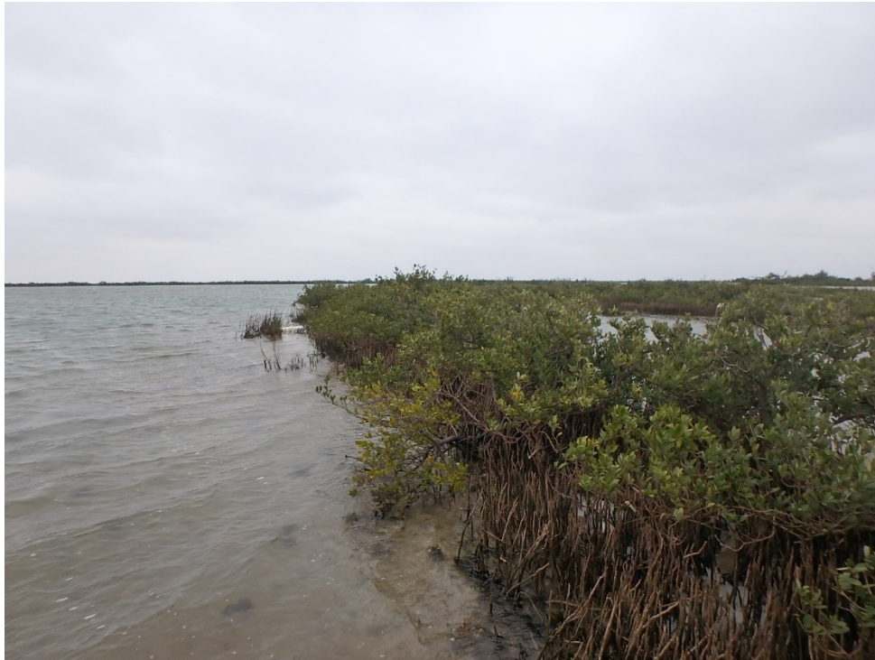
Representative E2SS (Estuarine, Intertidal, Scrub-Shrub)