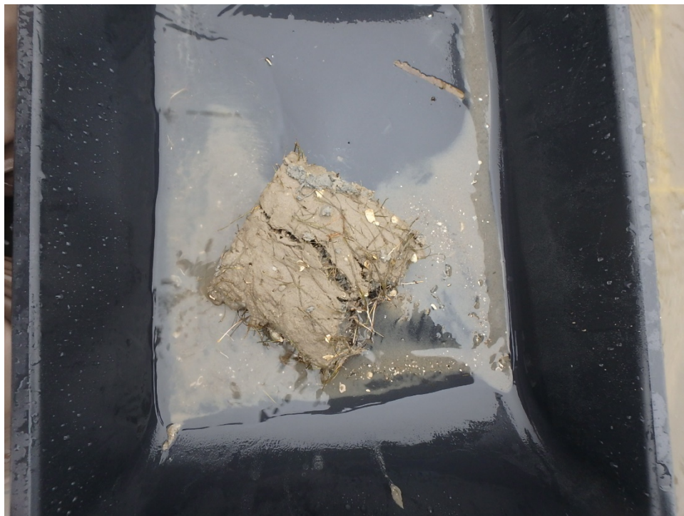
Representative E1AB Ekman Grab Sample – Halodule wrightii