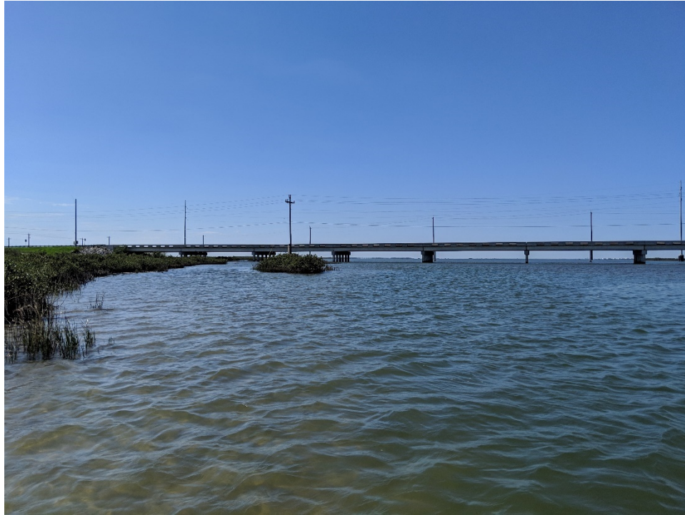
Representative Overview of Project Area.