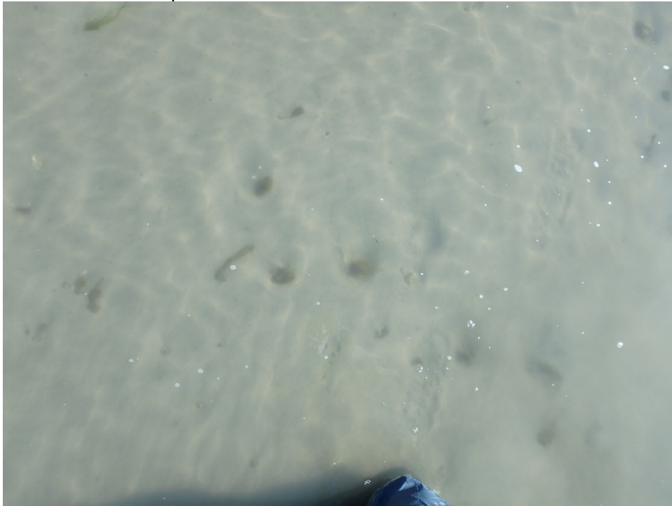
Representative Moderately Firm Mud or Sand