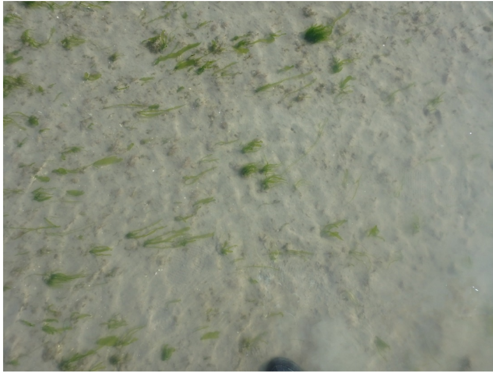
Representative Scattered Algae on Moderately Firm Mud