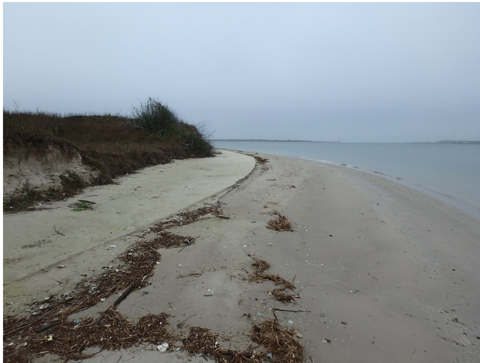
Representative E2US (Estuarine, Intertidal, Unconsolidated Shore)