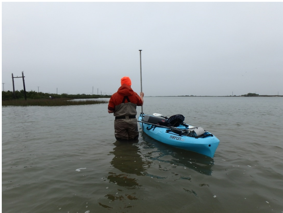
Substrate Poling Survey by Wading