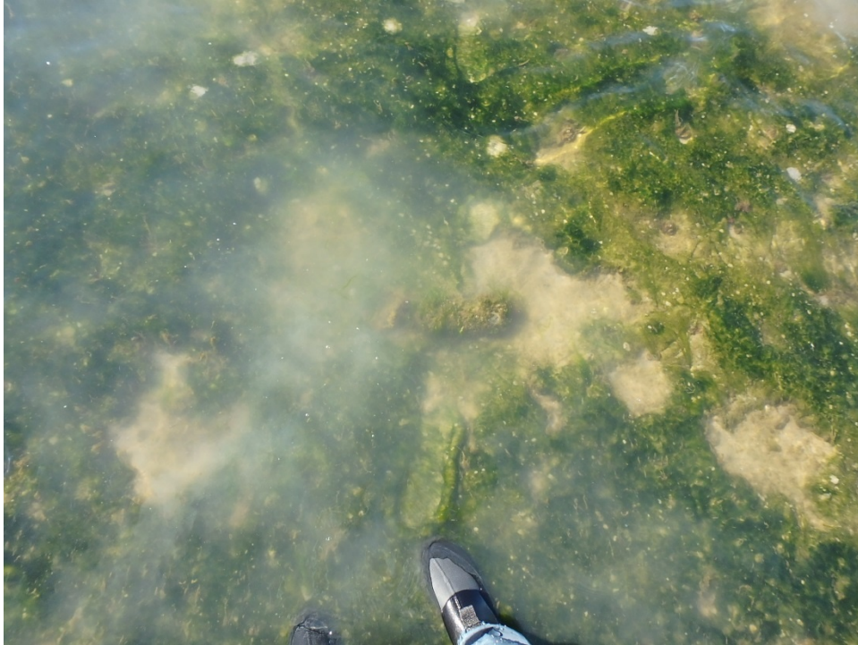
Representative Thick Algae