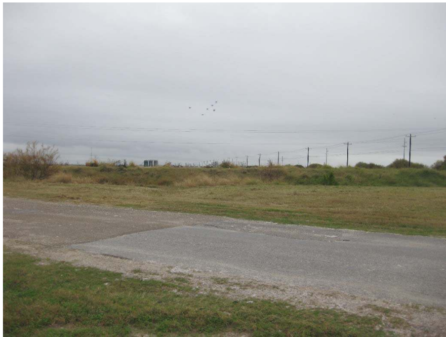
Photo 62 – Vegetation at Plot PL-16 looking easterly towards drainage feature.