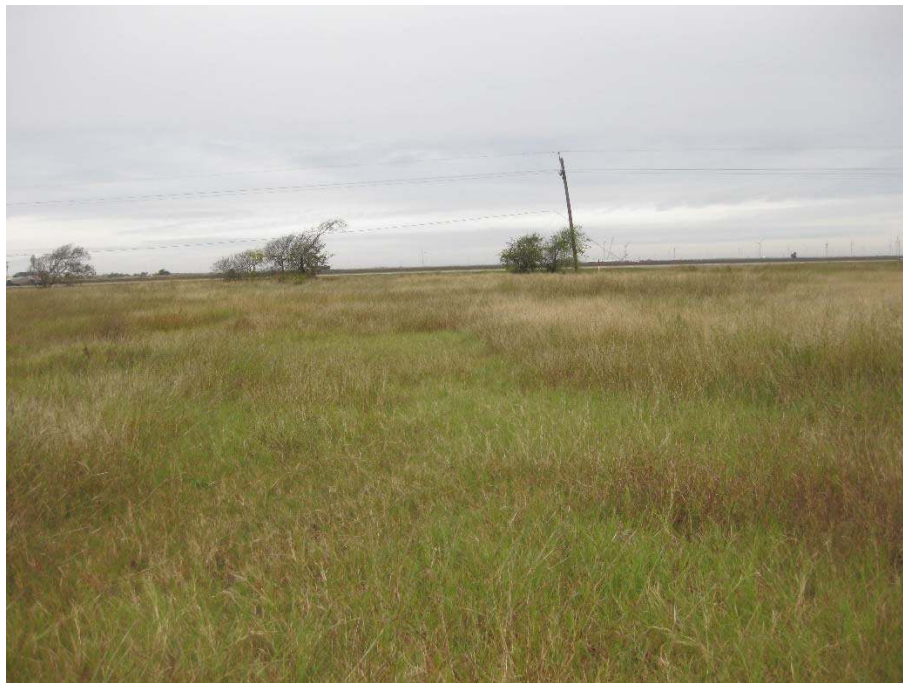
Photo 50 – Vegetation at Plot PL-10 looking westerly towards Hwy. 136.