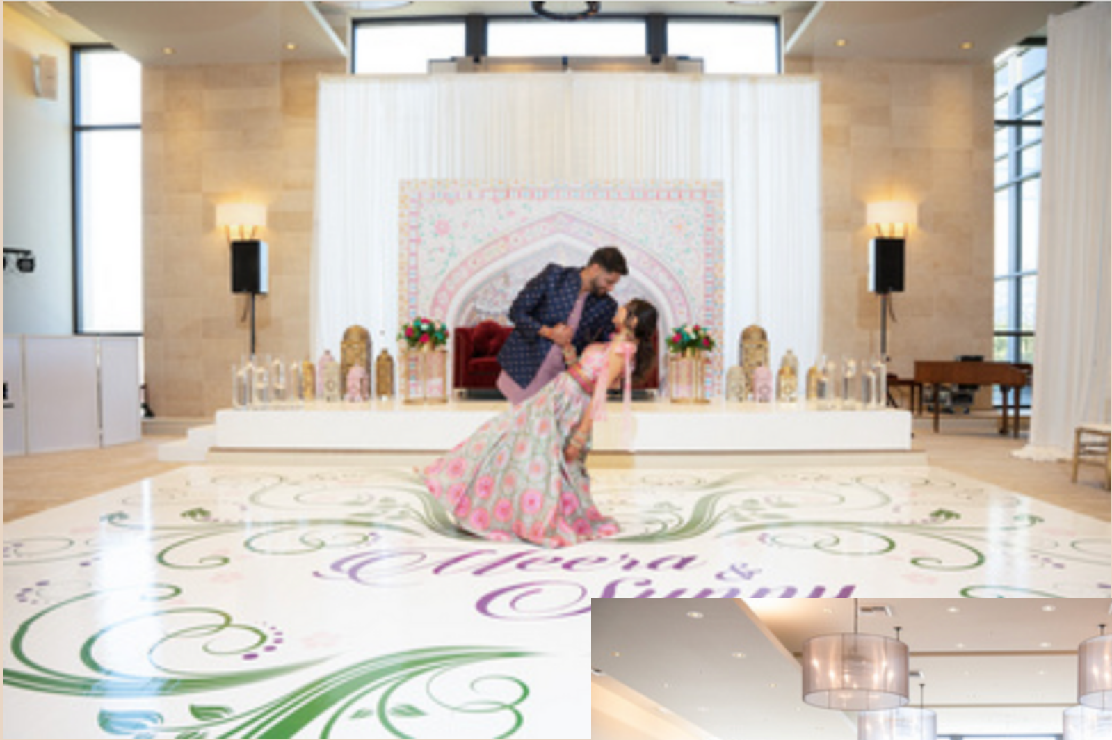
HINDU WEDDING & SANGEET 500 Guest Count