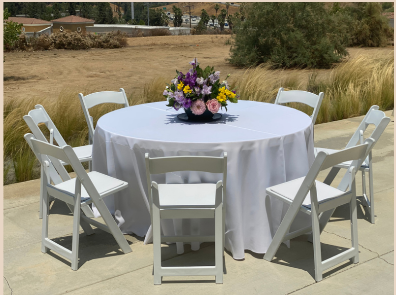
OUTDOOR LUNCHEON 50 Guest Count