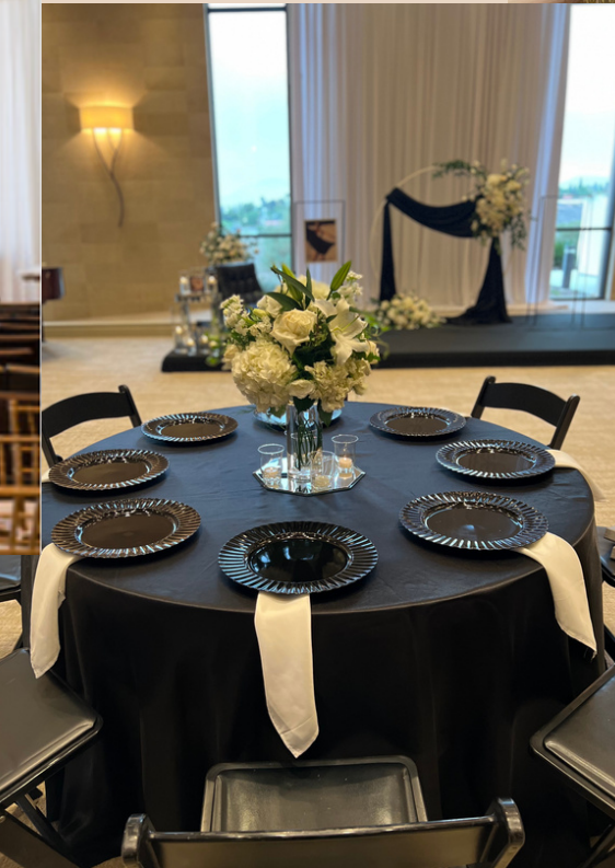
CELEBRATION OF LIFE 100 Guest Count