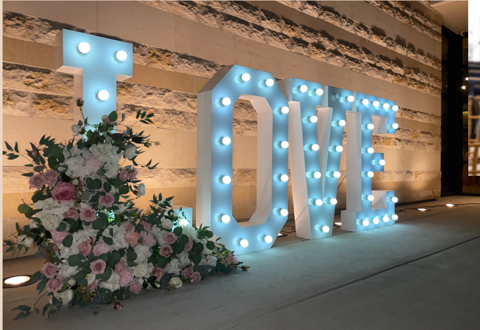
WEDDING 100 Guest Count