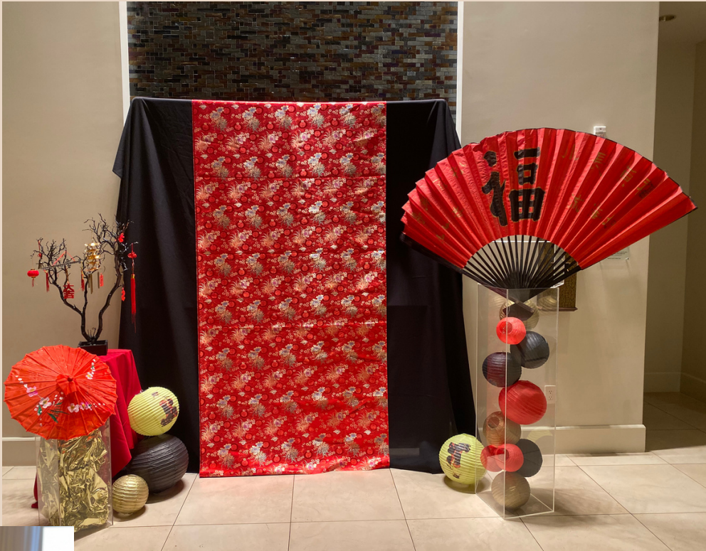
FUNDRAISER 300 Guest Count