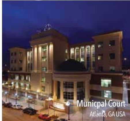
Municipal Court Atlanta, GA USA