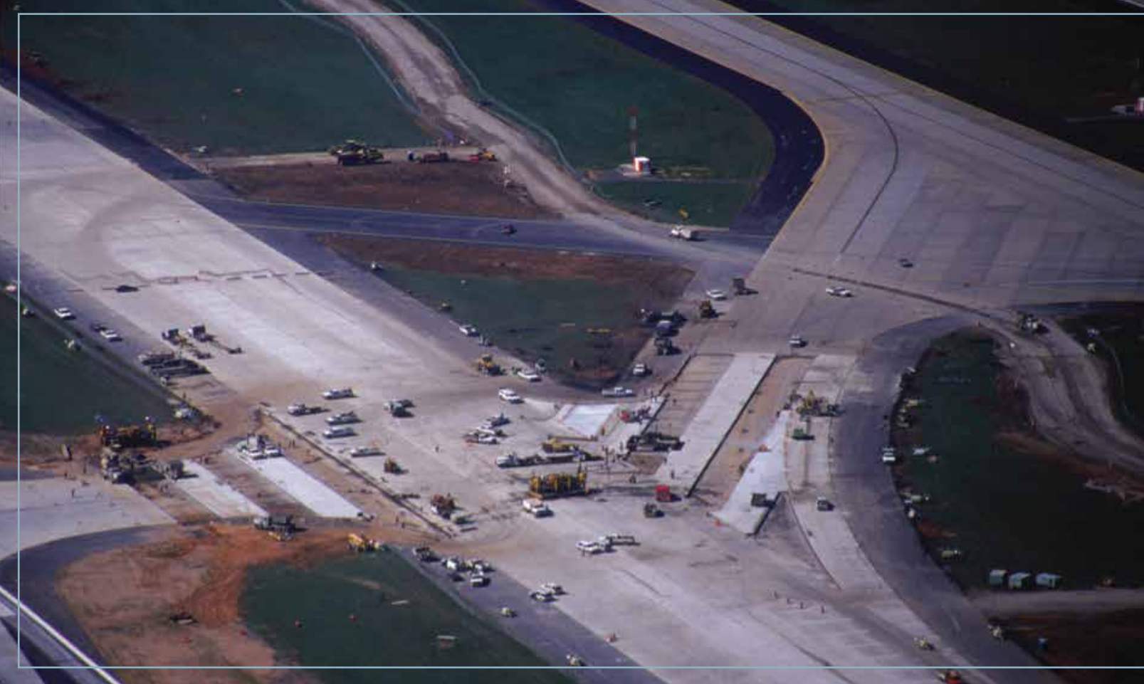
Hartsfield-Jackson International Airport Atlanta, GA USA