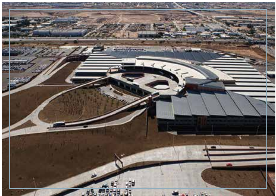
Sky Harbor International Airport RCC Phoenix, AZ USA