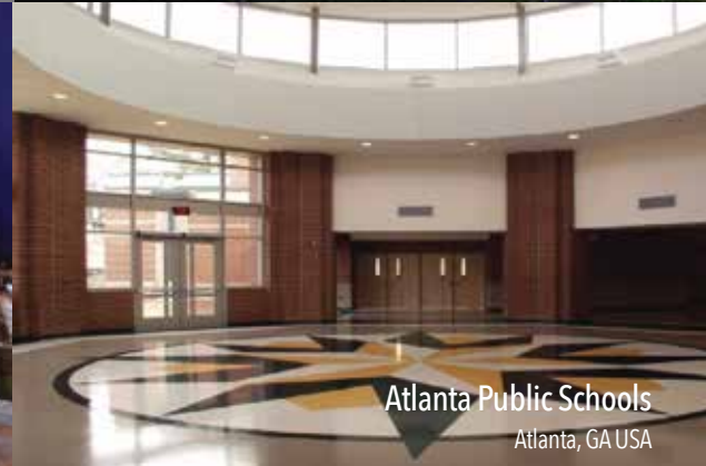
Atlanta Public Schools Atlanta, GA USA

Infrastructure development to build lives and enhance communities