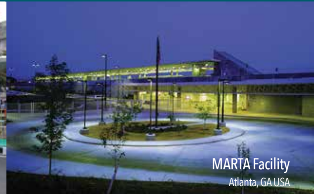
MARTA Facility Atlanta, GA USA