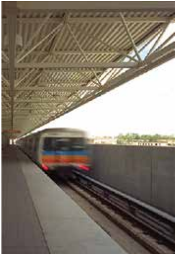
MARTA Atlanta, GA USA