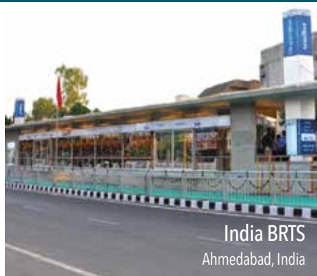
India BRTS Ahmedabad, India

SWA and educational institutions create partnerships to create stimulating, safe and vibrant learning environments. As part of a collaborative learning process we seek to understand the motivation, budget constraints, safe, security and technology required to create the learning environment of the future. We recognize that learning takes place beyond the classroom. SWA seeks to foster a learning environment beyond the walls to include the property ingress/egress, safe routes to school and ecological learning along the way.