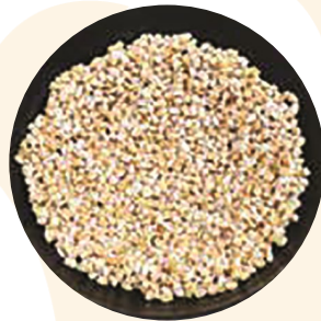
Farro Bowl $10.50