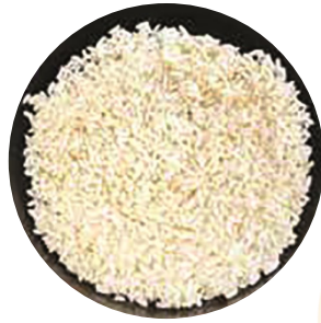
Rice Bowl $10.50