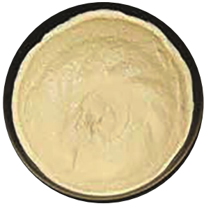
Hummus Bowl $10.75