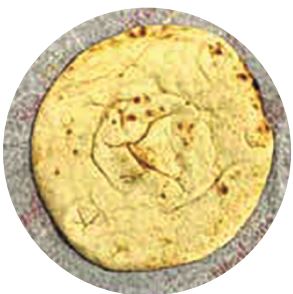
Gyro Bread Wrap $9.00