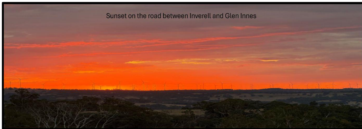
Sunset on the road between Inverell and Glen Innes

The latest Club fossicking trip took place over 6 th - 8 th March in northern New South Wales, covering the areas around Glen Innes, Inverell, Elsmore, Stannifer and Torrington. The trip was timed to coincide with the Minerama gem show and so some of our club members also joined the Minerama self-drive fossicking excursions which were being held as part of the show, offering a great chance to get local knowledge of the fossicking sites.