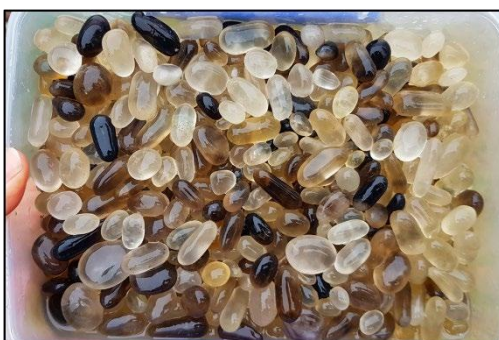
Jelly Bean quartz: water worn, rounded crystals

Located about 4.5 – 5 hours' drive (450km or so) south-west of the Gold Coast the fossicking locations in this area are famous for their ability to produce valuable, facet quality gemstones with sapphire, zircon, black spinel, garnet, quartz (citrine and clear), topaz, tourmaline, beryl (as emerald and aquamarine), fluorite and cassiterite known. VERY occasionally small diamonds are also found, to spice life up. Unlike in Queensland, a fossicking licence is not needed in NSW (unless you intend to fossick in state forest, in which case a $27.50 permit is required).