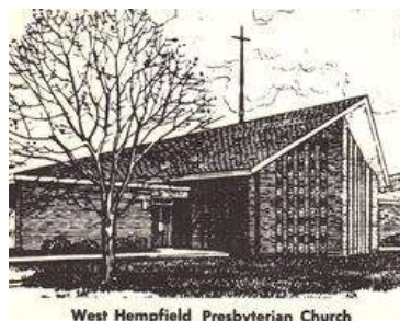
West Hempfield Presbyterian Church

Thank you for your cooperation and support!