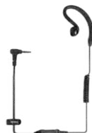
EHS30 Earpiece with in-line PTT & C-Earset