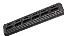
MCL35-S Multi-Unit Charger for Radios and Batteries