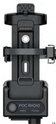
CK10 CAR KIT

The CK10 Car Kit is a rugged vehicle mounting assembly that enables the PNC380S to be installed on a vehicle dashboard and comply with DOT requirements. The Car Kit allows the PNC380S to be easily removed for handheld job-site communications. The Car Kit includes a locking bracket, an on/off power button, and ports for external speakers, microphones, and push-to-talk buttons. The CARKIT also functions as a docking charger for the PNC380S.