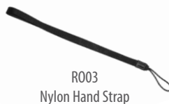
R003 Nylon Hand Strap