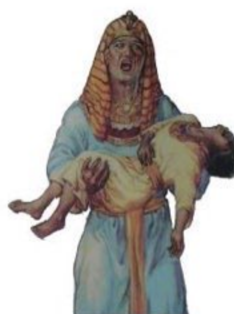
DEATH OF THE FIRST- BORN