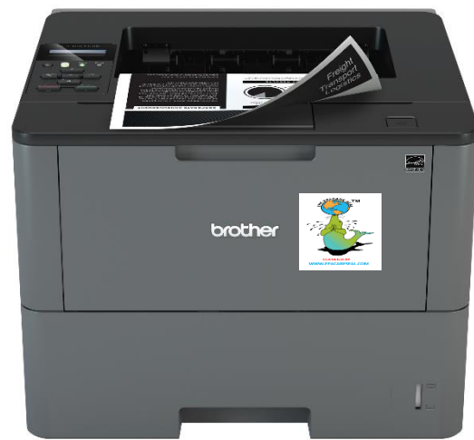
✓ Printer Passed testing certified !