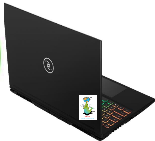
✓ Laptop Passed testing certified !