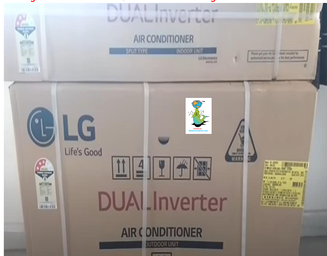
✓ Air Conditioners Passed testing certified !