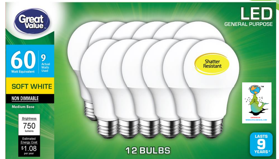
✓ Lightbulbs Passed testing certified !