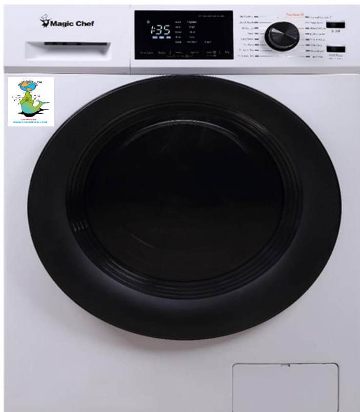
✓ Washing machine Passed testing certified !

ELECTRONICS AND HOME APPLIANCE WILL BE TESTED AND MUST PASS THE ENERGY USAGE AND EMMITANCE COMPLIANCE STRESS TEST TO BE CERTIFIED AND CARRY OUR LABEL ON THEIR PACKAGING AND LABELLING .