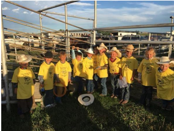
(Jubilee Mutton Busters)

HUGE THANK YOU TO LAST YEARS AMAZING SPONSORS!!!