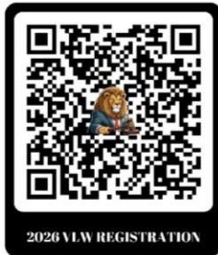
2026 VLV REGISTRATION

VISITING LIONS WEEKEND AND HALL OF HONOR IS SET FOR APRIL 10-11 REGISTRATION IS AVAILABLE NOW $50 PER PERSON - USE THE QRC ROUND-TRIP BUS FROM MISSOURI IS $125 PER PERSON INCLUDING REGISTRATION SEE BROCHURE FOR ALL THE DETAILS