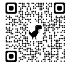
QR Code for Memorial Page

To leave a message for the family, please visit: https://everloved.com/life-of/general-brown/