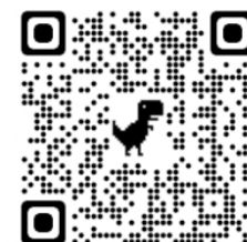
QR Code for Scholarship Page