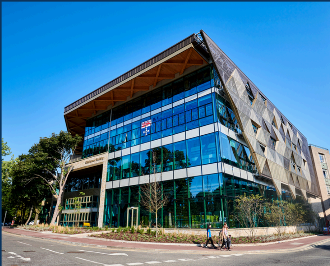
Stephenson Building (Campus Map Location 50)

https://www.ncl.ac.uk/who-we-are/contact/maps/