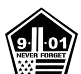
9-11-01 NEVER FORGET