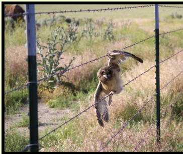
Above: Galileo found hanging from a fence, June 2016.