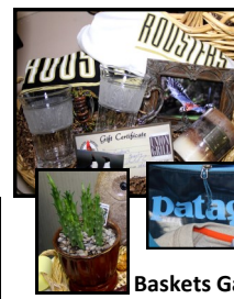
Baskets Galore! And Plants to "Patagonia Swag"