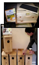
Nest boxes to Beehives