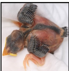
Left: a “Nestling” is a baby that is naked or without “true feathers”, this one belongs back in its nest.

Did You Find a Baby Animal on the Ground? Please call a licensed wildlife rehabber BEFORE picking it up; most often it’s just a fledgling being fed by its parents and learning to fly; keep pets away for 24-72 hours and it will be just fine. Wildlife parents always do a better job. If it doesn’t have all its feathers, it may have fallen from the nest too soon—call us and we’ll help you make the right decision. You can also go to our website’s Wildlife Resources section at www.wrcnu.org for our “I Found a Baby Bird” Flowchart.