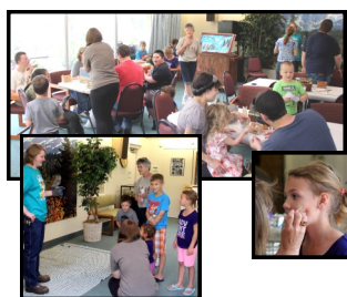
Kids' Crafts and Raptor Presentations