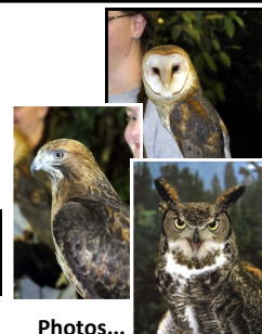
Photos... ... with Raptors

Our Annual Open House allows the public to meet our volunteers and staff, view parts of our facility, and through one-way viewing and Closed Circuit TV you may get a glimpse of any wildlife babies we have in our care.