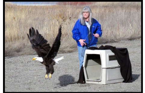
Bald Eagle "Aquila" (#30) released after mending a broken wing from a vehicle collision.

Pictured are some of the success stories that keep us energized to continue our work; more than 90% are reminders of the human impact wildlife is confronted with each and every day as we continue to encroach on or take away valuable habitat.