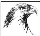
Golden Eagles $5,000 and Up