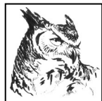
Great Horned Owls $50/Mo or $600—$1,199/Yr