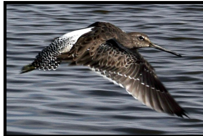
Storm Victim, this Long-billed Dowitcher is released just days later