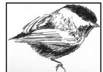
Chickadees $5/Month or $100—$179/Yr & Undisclosed CFC donors / Others