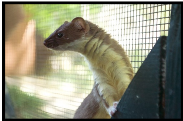
Orphaned Long-tailed Weasel kit in its new forever home at Oregon's Wildlife Images Rehabilitation and Education Center (WIREC)