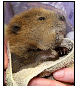
Orphaned and emaciated baby Beaver kit is healthy and projected for release once she is 2 yrs old