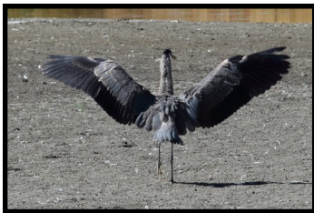
Left: a Great Blue Heron lands after a short but successful release flight