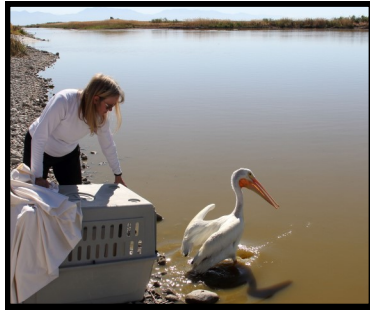
American White Pelican Released onto the Bear River Migratory Bird Refuge

WRCNU has treated over 16,000 wildlife patients in our short 7-1/2 years. As of this printing, we have seen 2,400 wild animals this year and it's still not over.