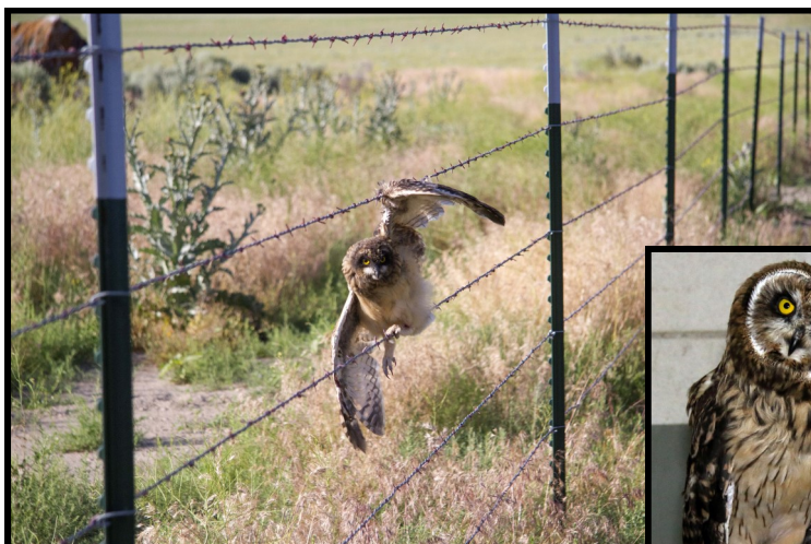
Above: Young Short-eared Owl entangled in barbed wire fence.

Our final success story starts with a fence and an owl, a tragedy we see repeated every year. Here a young fledgling Short-eared Owl is learning to fly and hunt with its parents when ... along comes a barbed wire fence . Fence and electrical/phone lines cause great pain and suffering, from broken legs and wings, to permanent feather follicle damage, to torn tendons. These injuries often lead to death from exposure and damage, but the lucky ones are returned to the wild after rehabilitation or, as in this case, they may become amazing education ambassadors. This fortunate young lady was spotted by two wildlife photographers and saved from certain death. After several months with WRCNU it was determined that she should not be released, but she is expected to be staying in the local area with SLC's HawkWatch International; she'll no doubt be a big hit for their education program.