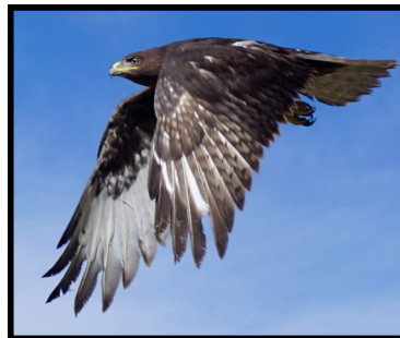
Juvenile Dark Morph Ferruginous Hawk released after a severe storm brought it down

Our final success story starts with a fence and an owl, a tragedy we see repeated every year. Here a young fledgling Short-eared Owl is learning to fly and hunt with its parents when ... along comes a barbed wire fence . Fence and electrical/phone lines cause great pain and suffering, from broken legs and wings, to permanent feather follicle damage, to torn tendons. These injuries often lead to death from exposure and damage, but the lucky ones are returned to the wild after rehabilitation or, as in this case, they may become amazing education ambassadors. This fortunate young lady was spotted by two wildlife photographers and saved from certain death. After several months with WRCNU it was determined that she should not be released, but she is expected to be staying in the local area with SLC's HawkWatch International; she'll no doubt be a big hit for their education program.