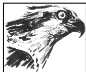
Ospreys $100/Mo or $1,200—$4,999/Yr