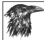
Ravens $20/Month or $240—$419/Yr