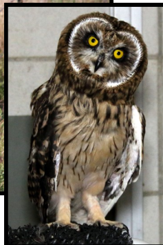
Left: the inset photo shows the same juvenile after a couple months of rehab—you might notice the left wing does not sit quite right due to tendon damage from the fence.