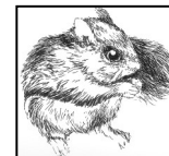
Flying Squirrels $15/Month or $180—$239/Yr