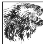
North American Beavers $35/Month or $420—$599/Yr