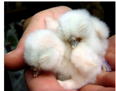
Baby Owls lost home When tree was cut down

The Wildlife Rehabilitation Center of Northern Utah has taken in nearly 2,000 wild animals so far this year. Animals that would not have survived without the unique services made possible by your valuable contributions. Most of the animals we see have come to our facility due to some type of human-caused impact: gunshots, electrocutions, litter entanglement, pet attacks, various inhumane traps, loss of habitat and misplaced goodwill. We are able to release approximately 65% of these animals back into the wild and find licensed education facilities for many non-releasable animals, thanks to your generosity and support.