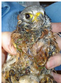
Male Kestrel caught in "Bird Repellent Gel"