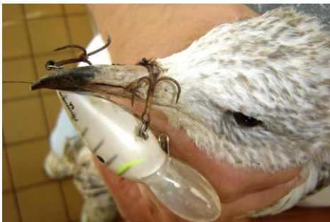
Gull Starving after "eating" lure

Through wildlife rehabilitation and education we will empower the community to engage in conservation and responsible stewardship of wildlife and habitat.