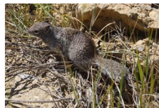
Rock Squirrel release