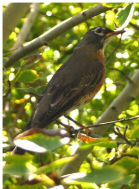
American Robin release

This year WRCNU received a nestling Golden Eagle with a tragic past and inspiring future. His harrowing experience and incredible survival from a man-caused wildfire has given him and his story national as well as international attention. This magnificent young "Phoenix" has given us a great opportunity to reach people's hearts and relay the important message that our organization has been striving to make— accountability for human impact on nature . Please join our following on Facebook for more information about Phoenix and friends by liking the Wildlife Rehabilitation Center of Northern Utah.