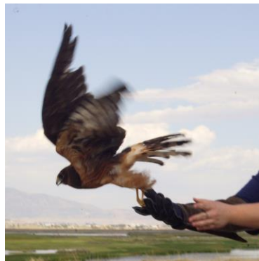
Northern Harrier release