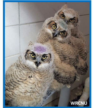
N Ogden branchers; These three will be released later this summer