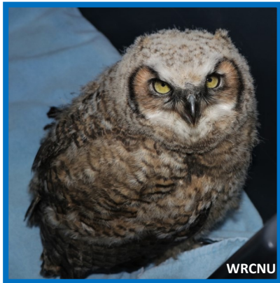
SLC Cemetery Fledgling; sadly we were unable to save this youngster.

Most were at the "branching" stage where at around 5 weeks of age the babies begin exploring/hopping/climbing around on the branches near their nest. Once they got blown out of their trees; as they could not fly, they were on the ground and couldn't get back up to their nests. As the nests were 20' - 60' up they couldn't be accessed (one rescuer checked with their local Fire Department and their ladders wouldn't reach the nest!). Their observant rescuers saw that they were in danger from loose pets, inquisitive children, traffic and other predators and brought them to the "WRCNU B & B."