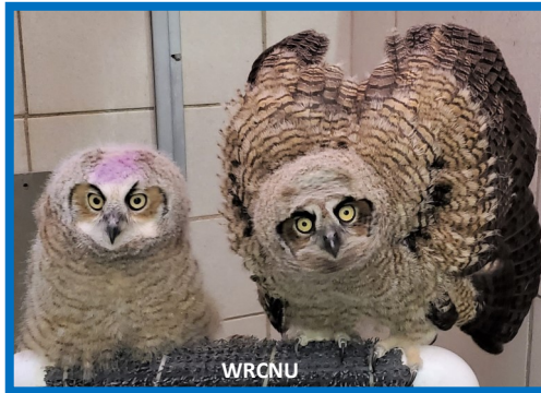
Two single branchers WRCNU placed together and are expected to be released later this summer.