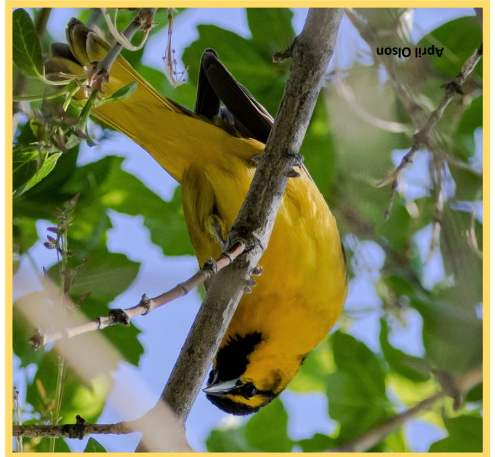
Bullock's Oriole Patent Released—May 2021

Wildlife Rehabilitation Center of Northern Utah 3127 N Pelican Drive Farr West, UT 84404 www.WRCNU.ORG RETURN SERVICE REQUESTED