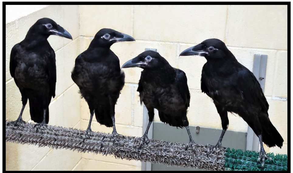
Above Left , five Raven nestlings arrive mid-May; Above Right , four of the same Ravens are now self-feeding. One arrived with "splay-leg" and is in a cast in a separate enclosure for the next several weeks as his/her legs heal up.