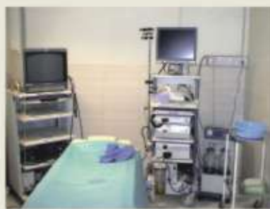
A view of the Endoscopy Unit