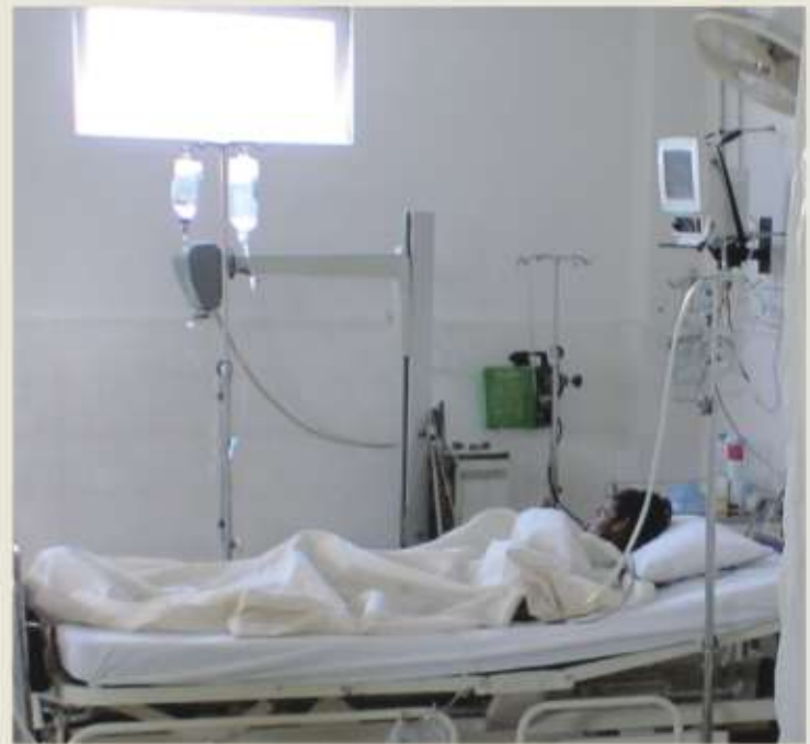
Commitment to serve!

Nigahban is a hope for many more Usmans with support from kind people.