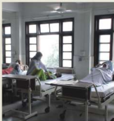
Patients recuperating after endoscopy