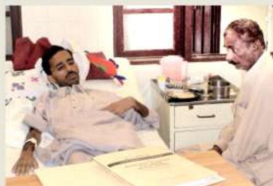
Responding to care!