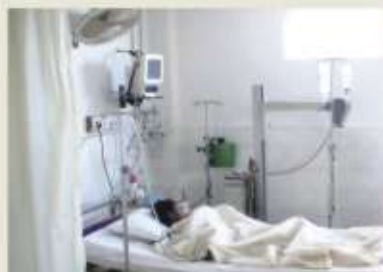
High Dependency Unit