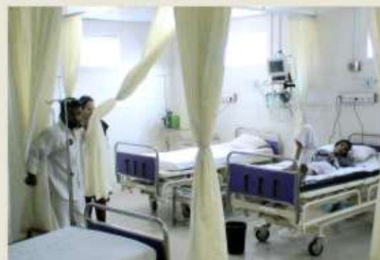
Quality treatment in pristine environment