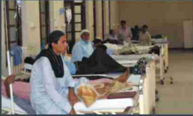
Patients in Medical Ward of Surgical Unit IV