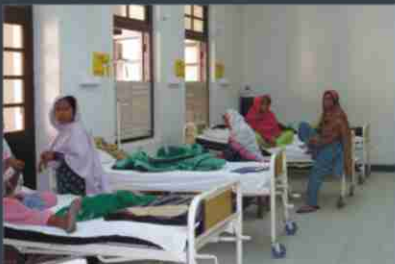
Female patients in Medical Ward of Civil Hospital