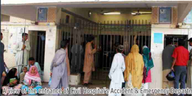
A view of the entrance of Civil Hospital's Accident & Emergency Department

More than 900 patients arrive at Civil Hospital's Accident & Emergency Department every day. Many of them could have gone to other hospitals but the quality care and their poor financial status brings these people here.