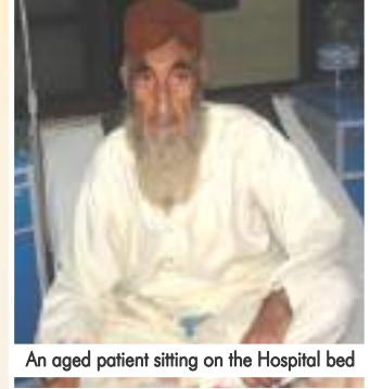
An aged patient sitting on the Hospital bed