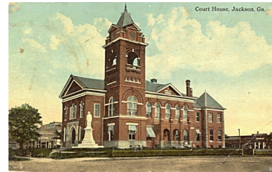
Butts County Courthouse 1911

The current Butts County Courthouse was constructed between 1897 and 1898 at the center of the downtown Jackson square, following an expansionist period in Georgia. Community leaders, seeking to show off civic pride, as well as to secure Butts County's place in the "New Georgia" that was unfolding in the twilight years of the 19 th century, determined that the best way to show the