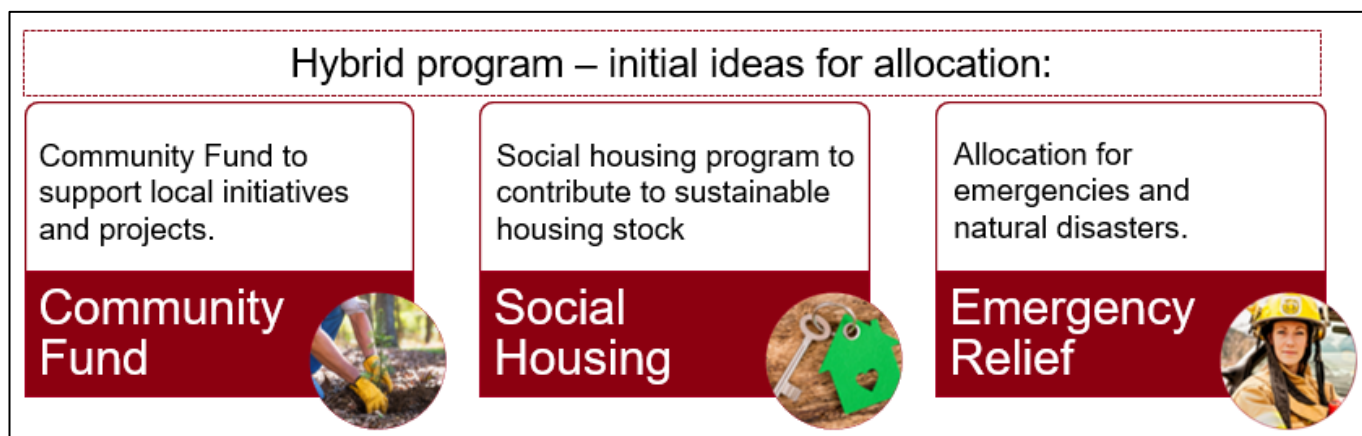
Figure 13-2 Community Benefit Fund Hybrid Model

of affordable housing and in response to emergencies and natural disasters and further informed by the Community Advisory Group (refer Section 11.3.2 ).