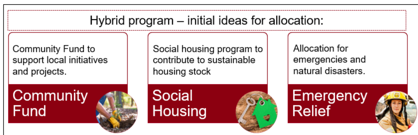
Figure 13-2 Community Benefit Fund Hybrid Model

In February 2022, the CWF announced a Community Benefit Fund (CBF) for the life of the project (commencing during construction) to provide enduring value to the Ravenshoe and associated Tablelands LGA communities from the proposed Action. The CBF is intended to share an industry-leading allocation of funds approximating $500,000 per annum towards initiatives the community cares about under a hybrid model as illustrated in Figure 13-2 . Initial feedback from stakeholders indicates the community could benefit from the CBF by allocations towards a shortage of affordable housing and in response to emergencies and natural disasters and further informed by the Community Advisory Group.