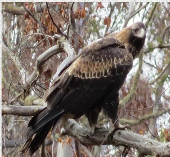
St Patricks Plains Wedge-tailed eagle

Your support will help us fund research, advocacy and publicity about St Patricks Plains turbines and give us access to the best environmental and planning consultants and legal advice in Australia.