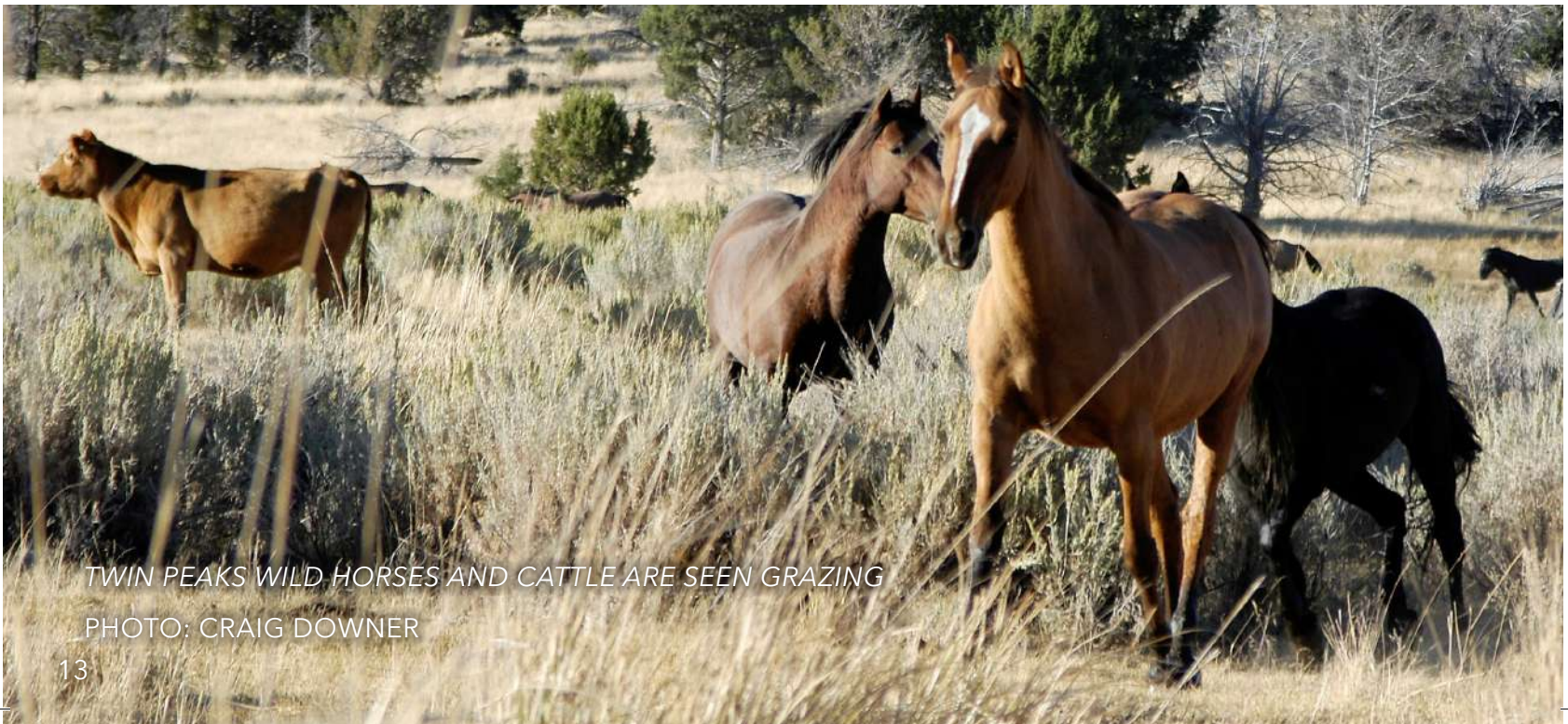
TWIN PEAKS WILD HORSES AND CATTLE ARE SEEN GRAZING

We are so very grateful to PEER for achieving such critical information which shows what we have always believed - that wild horses are good stewards of the land.