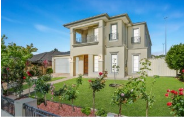
16 Mayfield Drive