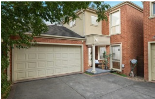
2/7 Briggs Street