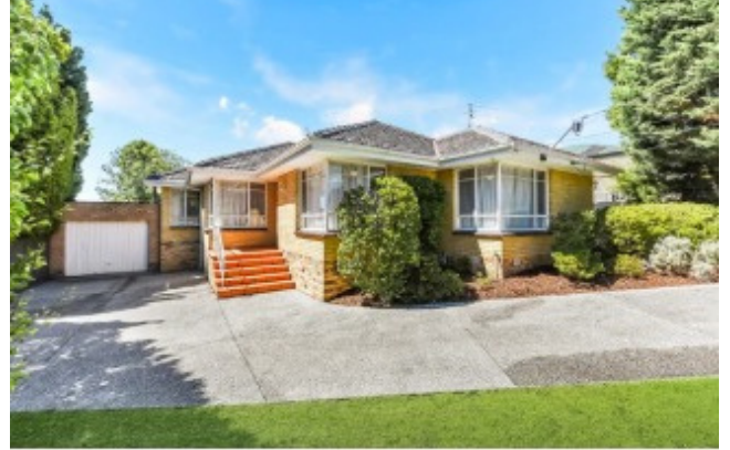
18 Bradstreet Road