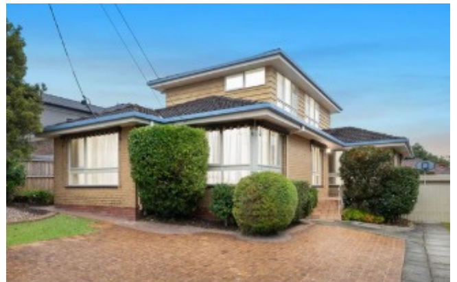
15 Palm Beach Crescent