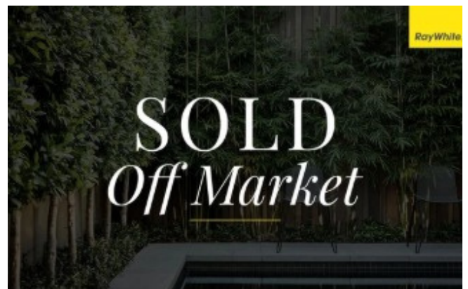
553 Stephenson's Road