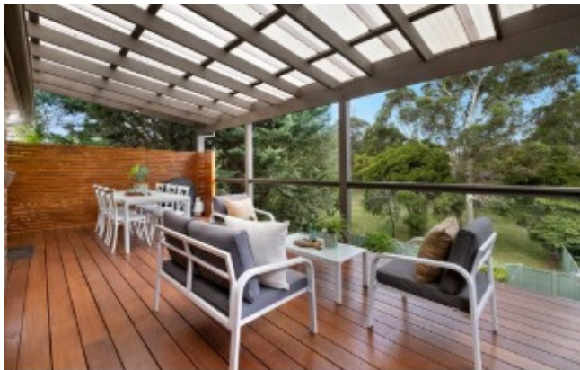
64 Smyth Street