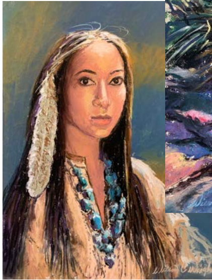
“The Magic of Turquoise”