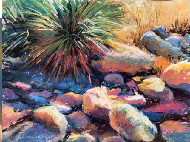
“Rock My World”