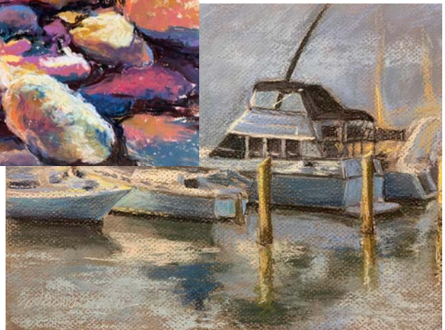
“Free at Any Moment Now”