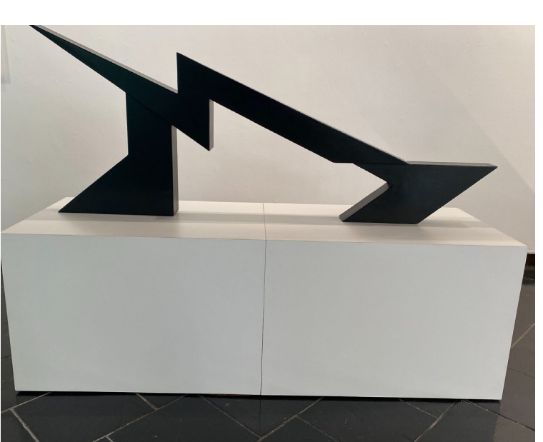
Small-scale "Black Lightning" and drawing for "X"

For further information on the exhibit, email joseph.