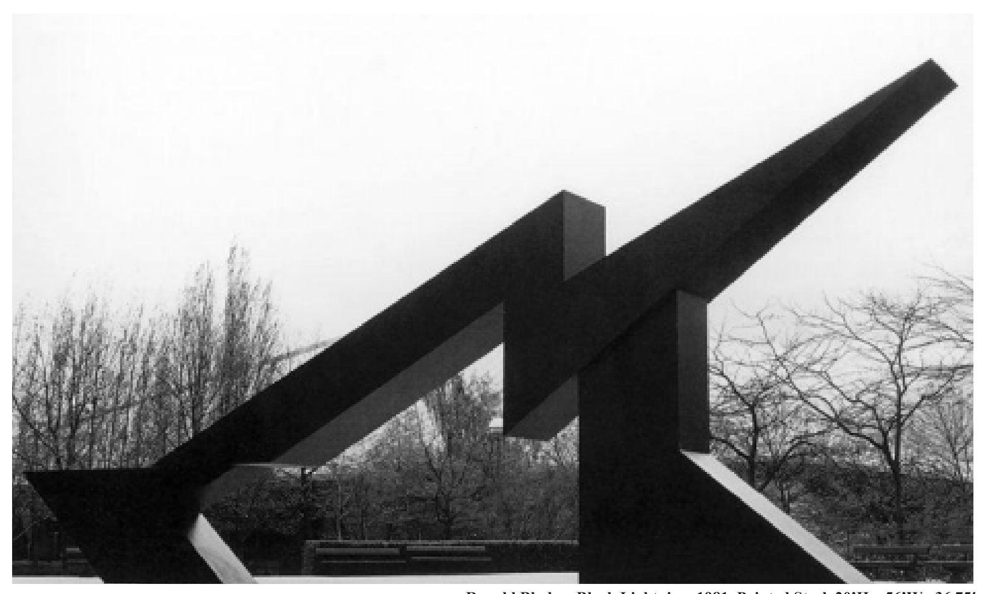
Ronald Bladen, Black Lightning, 1981, Painted Steel, 20'H x 56'Wx 36.75'

The latest show at the WCC Art Gallery, located on the 3rd floor of the Hankin Academic Arts Building (HAAB,) features the work of the American artist Ronald Bladen (1918-1988). The exhibit is called 'Angle / Edge / Plane' and will be open to the public through Nov 30.