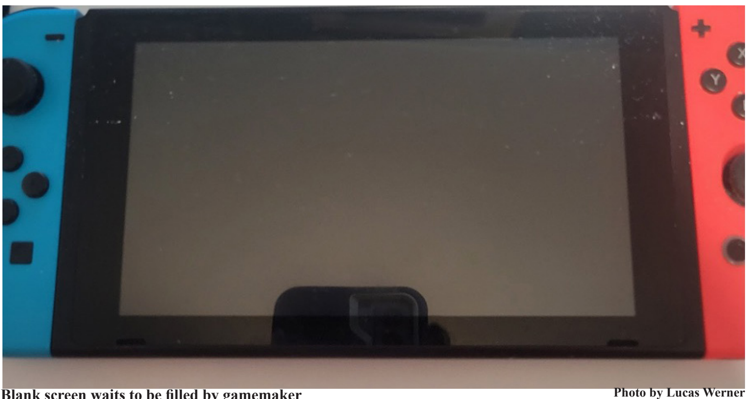
Blank screen waits to be filled by gamemaker

And that's how you write a video game storyline. Writing your own story takes time and effort; a few extra hands wouldn't hurt. I speak from experience, as I am currently at work on a new game myself. If anyone would like to know more about the process, I can be reached through The Viking News.