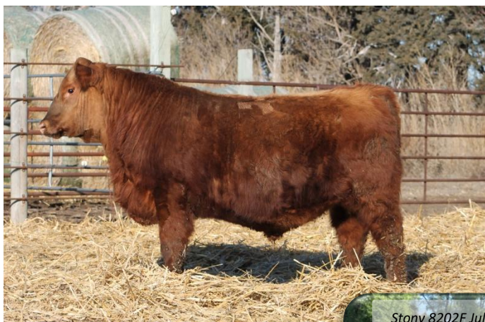
Stony 8202F July 2023