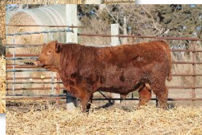
Full brother to 534N; 421M 2025 sale