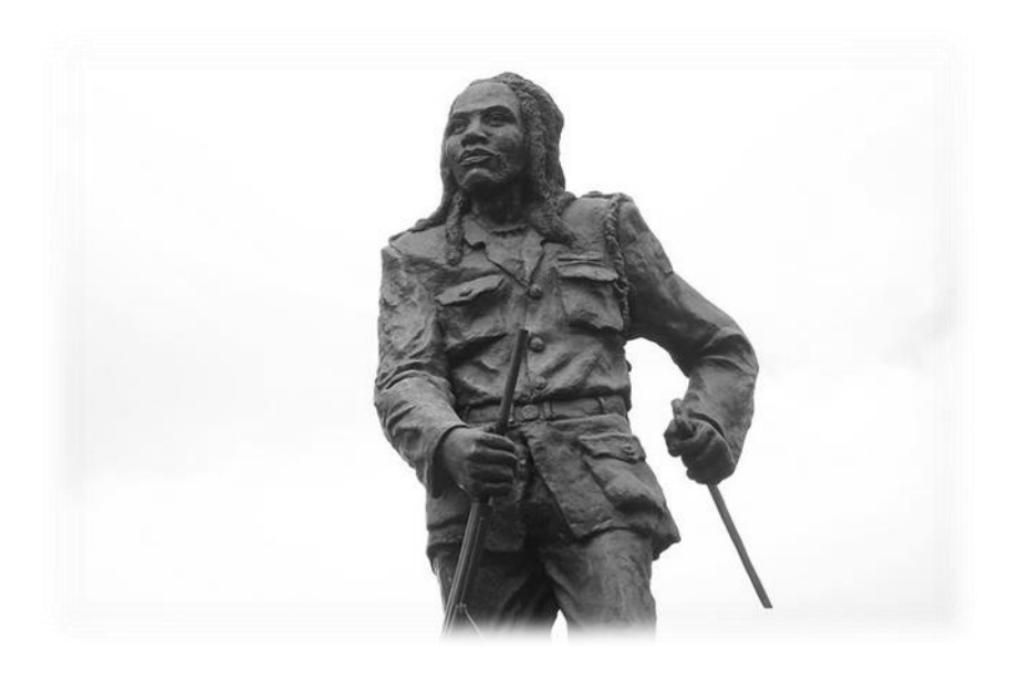
Finest son Alkabulan ever produce: Kimathi wa Waciuri

The perfect example of the Nyahbinghi irits was revealed in the Mau Mau warriors (Mau Mau - an anagram of Uma Uma means "get out settlers get out, so that African get freedom" and was a military codeword based on a secret language) Uprising under the tutulage of Kenya Land and Freedom Army (KLFA) under the command of Field Marshal Dedan Kimathi Waciuri (truly, Kimathi wa Waciuri), (31 October 1920) where Alkabulan people went to a military confrontation ina Kenyaland, from 1952 to 1960, by the Kikuyu-dominated anticolonial-warriors named Mau Mau and the British Army. The confrontation set the stage for Kenyan partial independence and motivated Alkabulans in other colonised regions in the continent to fight and advance against western and eastern colonialism.