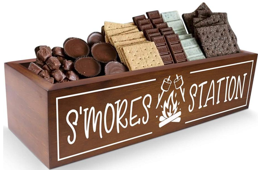
After Dark Bonfire and S'mores ...we even provide the S'more sticks and S'more Station box! (Chocolate, Marshmallows, Graham Crackers not included)