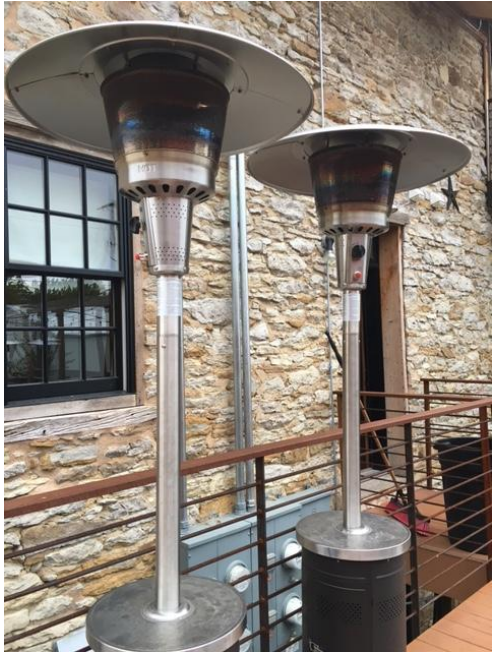
Commercial Patio Heaters (2) Option