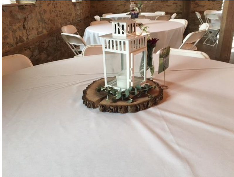
Typical center piece arrangement using all PHS acc.