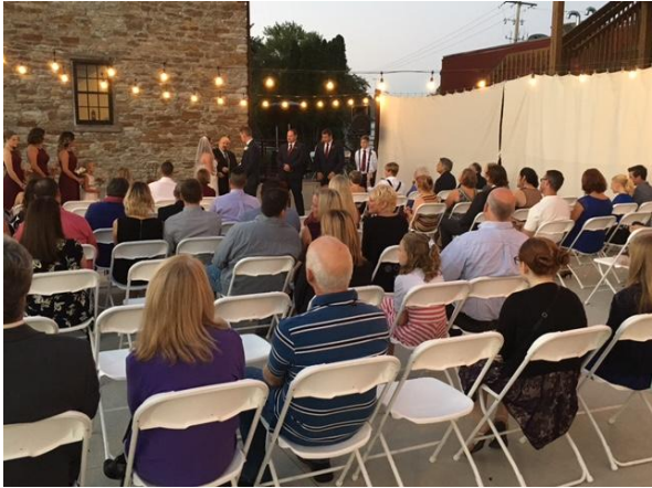
Outside Terrace Ceremony with String Lights