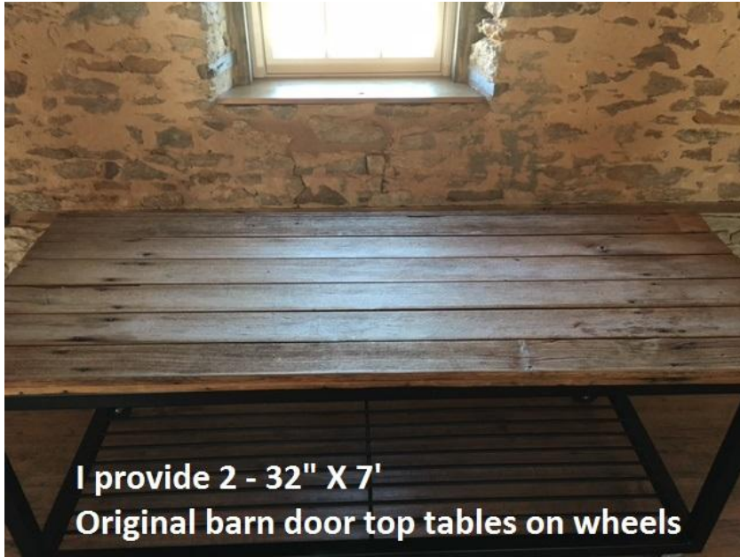
I provide 2 - 32" X 7' Original barn door top tables on wheels