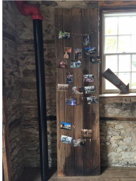
Entry barn door picture pinup