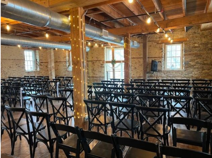
Black Wood Strap Back Chairs