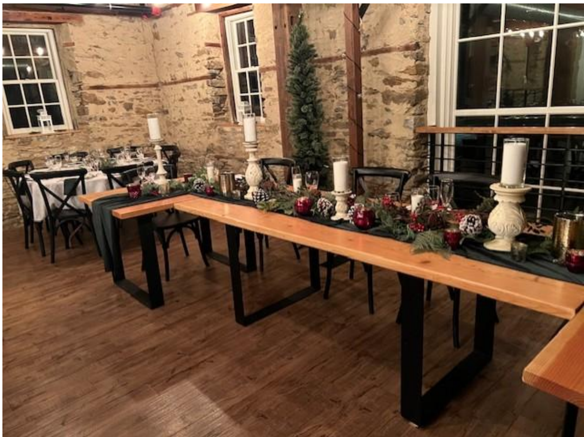
an authentic rustic winter wedding venue