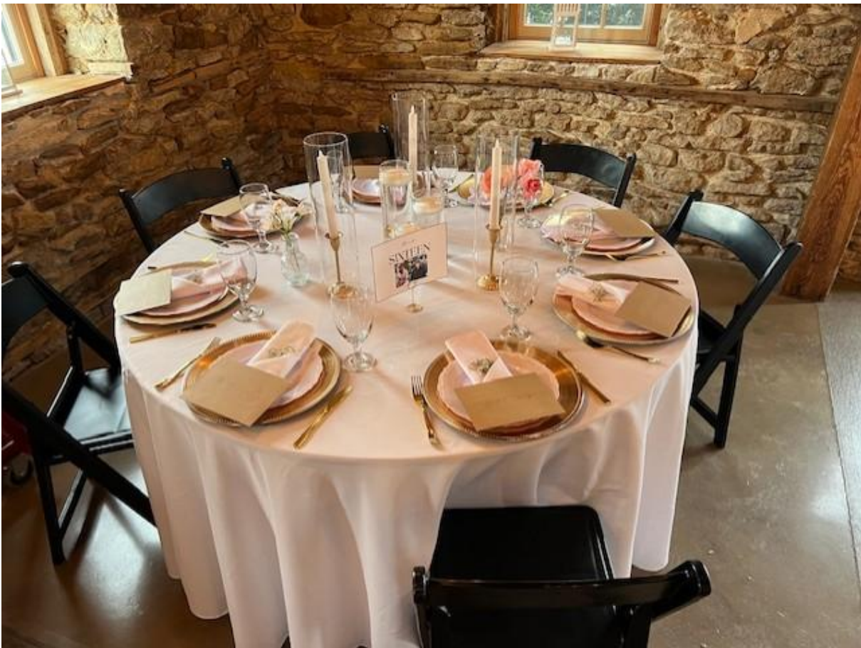
an authentic rustic winter wedding venue