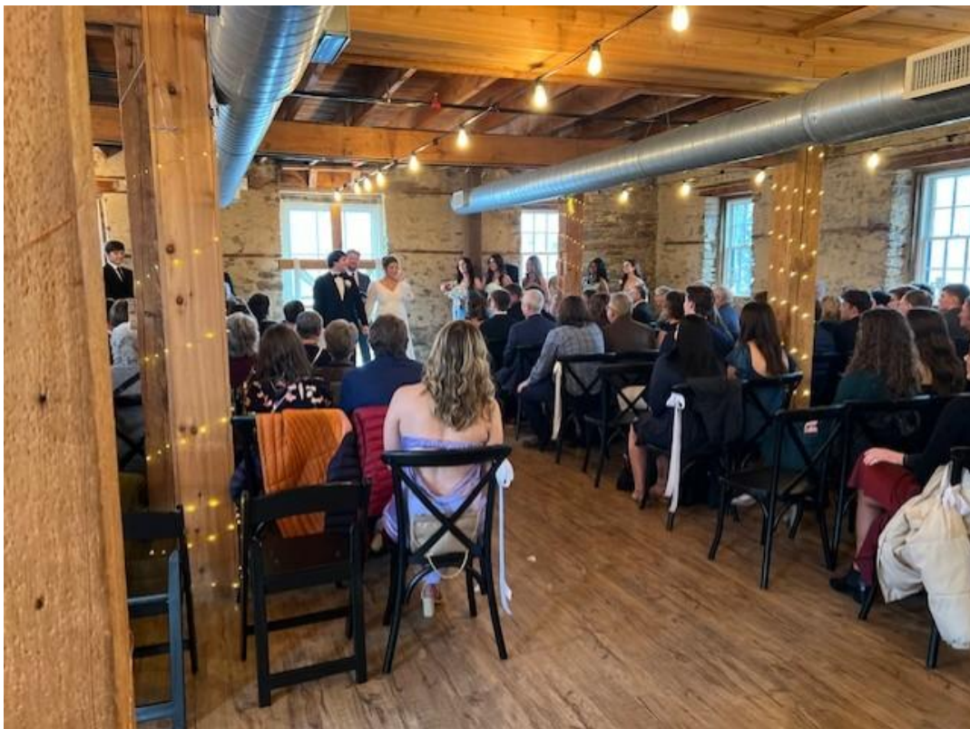
an authentic rustic winter wedding venue