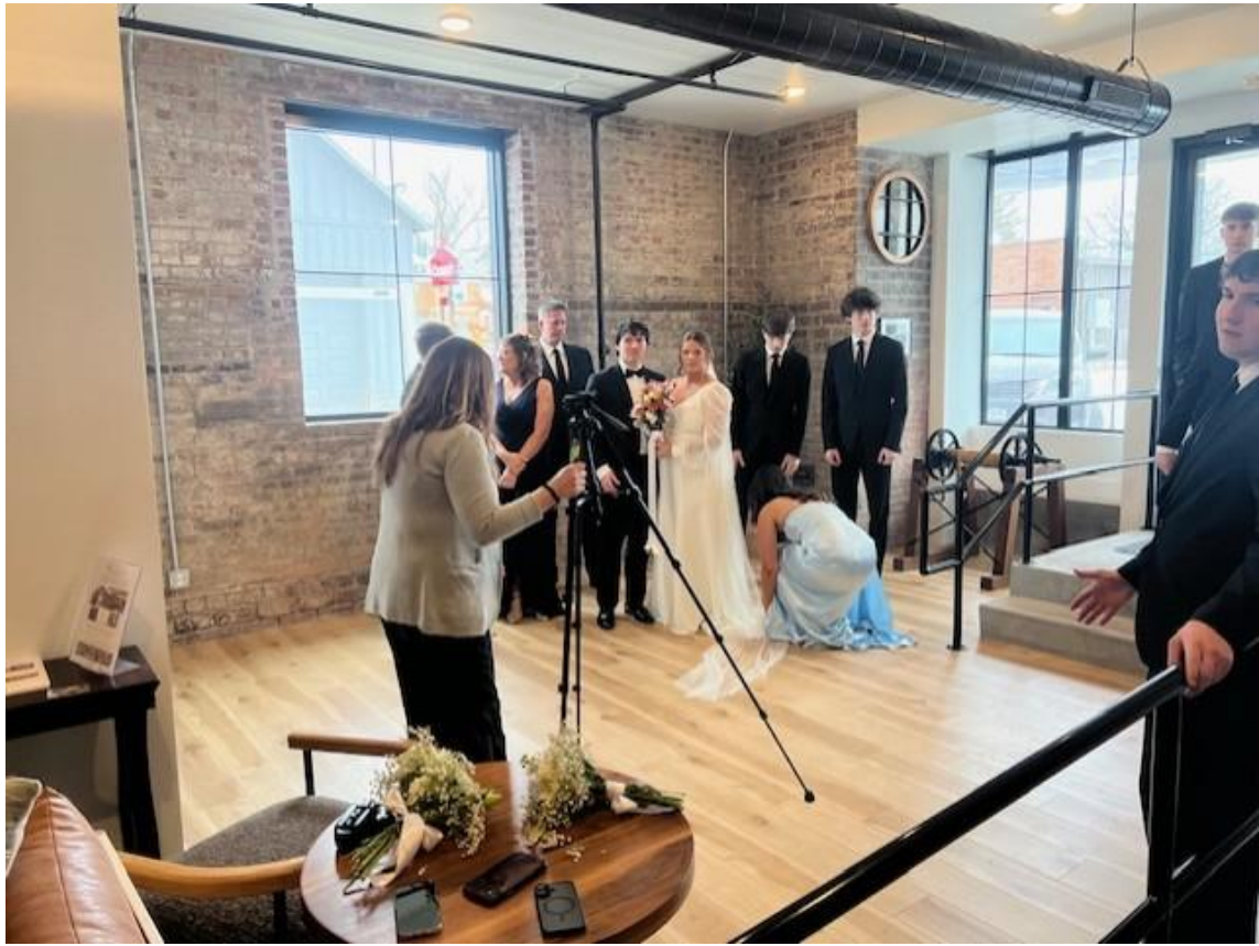
Photo opportunity at The Literary Hotel lobby