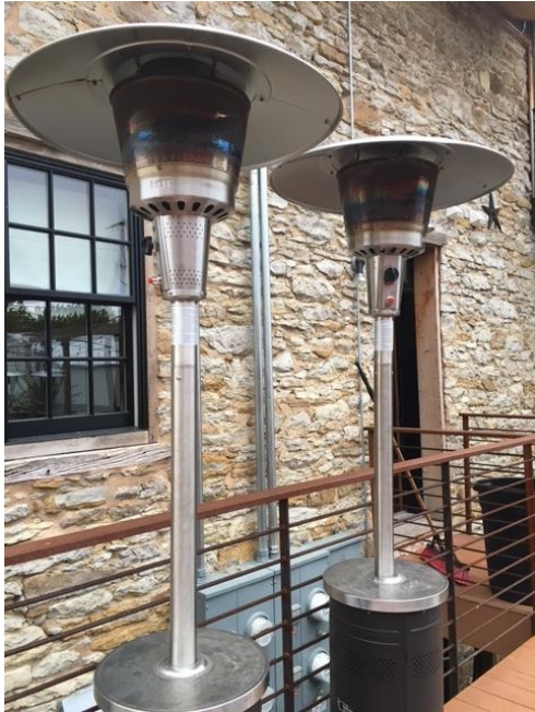
Commercial Patio Heaters (2) Option