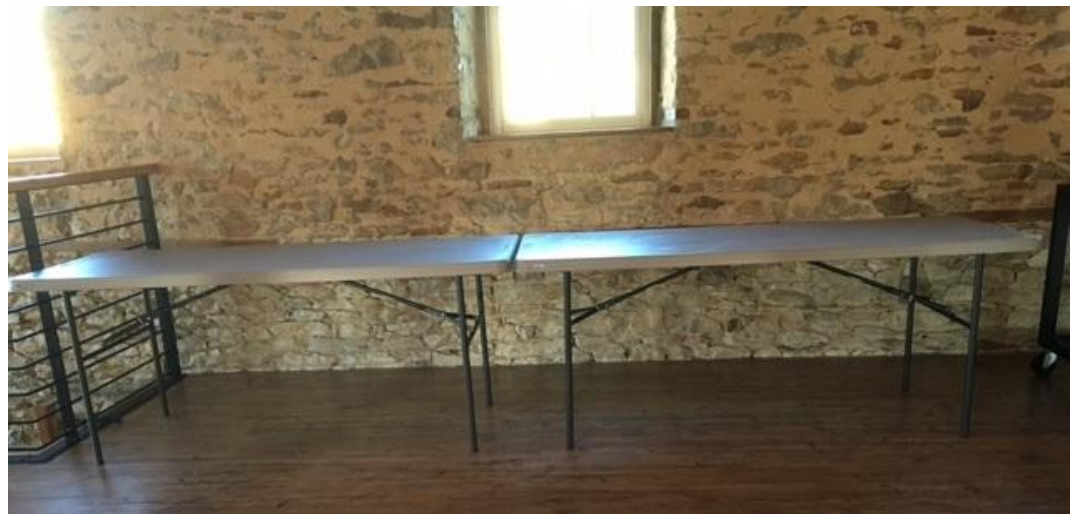
6'-Buffet Tables (5)