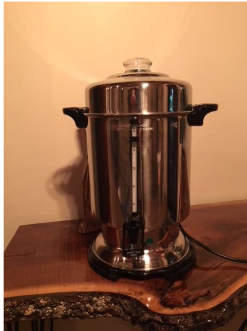
60 Cup Coffee Maker