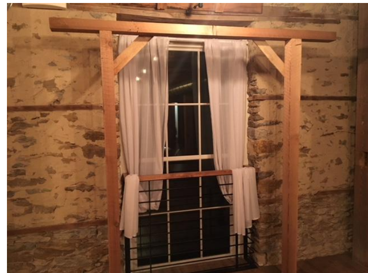
Indoors and Outdoors Cedar Beam Alters (2) you can decorate