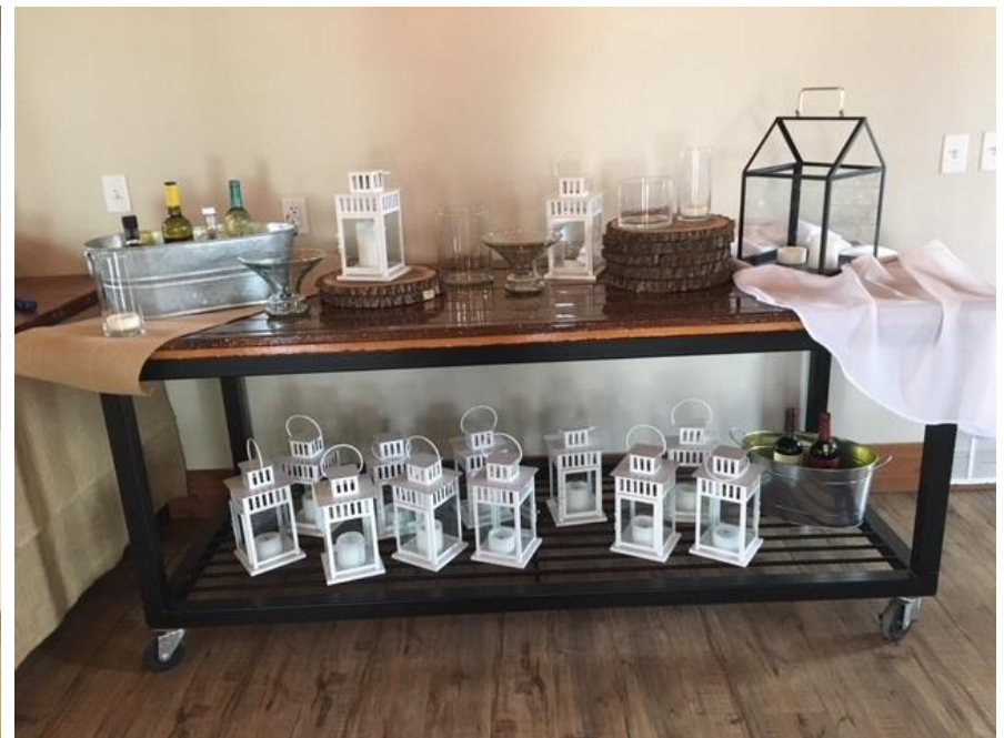
Various accessories you can use