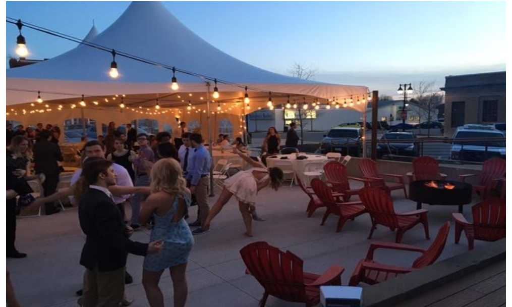
Front terrace and a Bonfire we will build, light, stoke and manage.