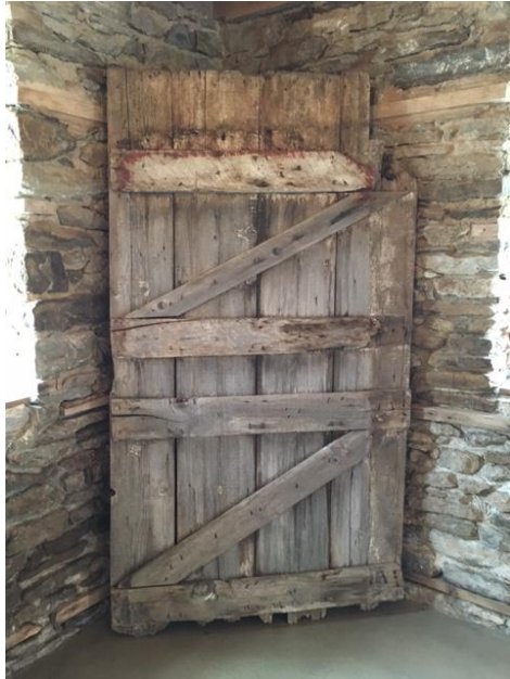
Rustic Back drop for photo booth