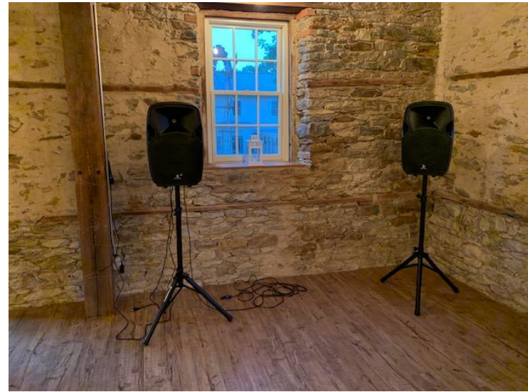
PRORECK PARTY 12 Portable Professional PA Speaker System (New July 2019) Bluetooth/USB/SD Card Reader FM Radio/Remote Control/Speaker Stand

For use indoor ceremony and speeches, or outdoor on the terrace during ceremony.