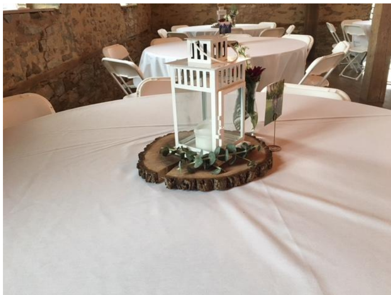
Typical center piece arrangement using all PHS acc.