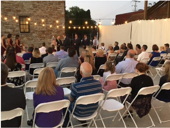
Outside Terrace Ceremony with String Lights