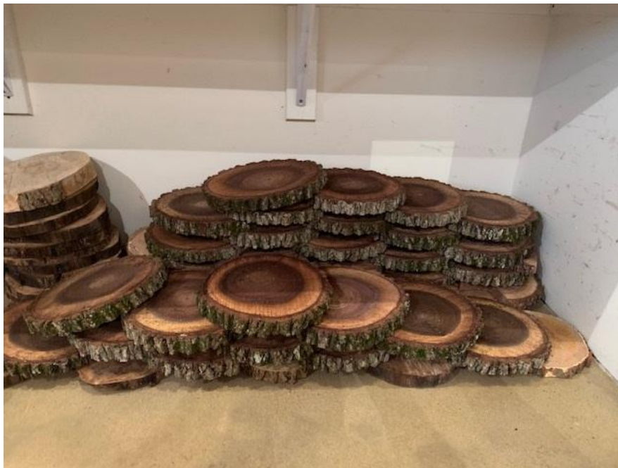
Newly cut each year live edge centerpieces