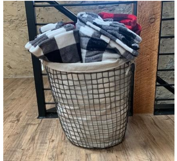
Sitting outside? We got you covered.