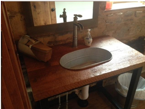
4 Rest Rooms