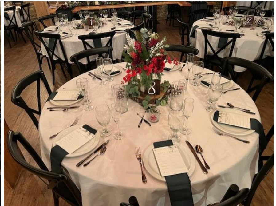
Round tables | Tablecloths Included