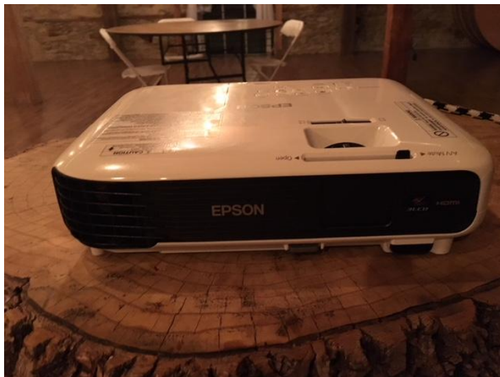
EPSON Projector and Screen

For use indoor ceremony and speeches, or outdoor on the terrace during ceremony.