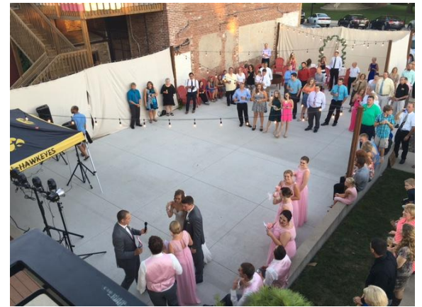
Music Lights and Dancing under the stars