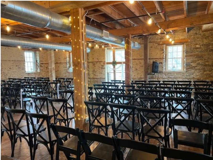
Black Wood Strap Back Chairs