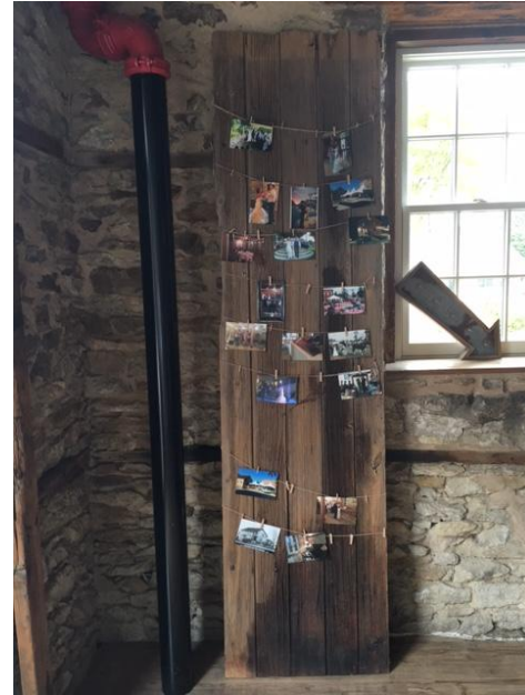
Entry barn door picture pinup