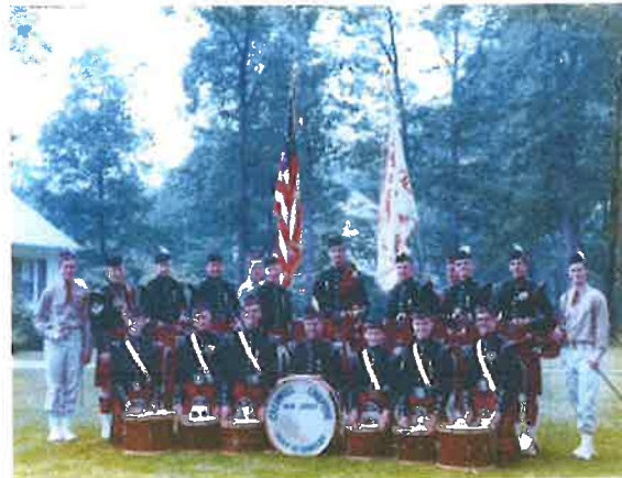
Caldwell Chapter Bagpipe Band