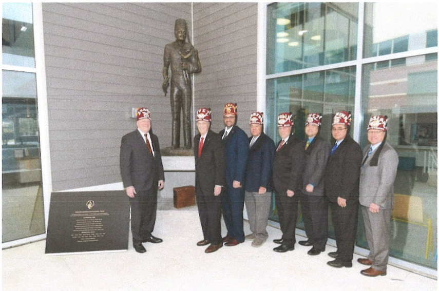
PHOTO: On January 27, 2025, the time capsule was sealed.