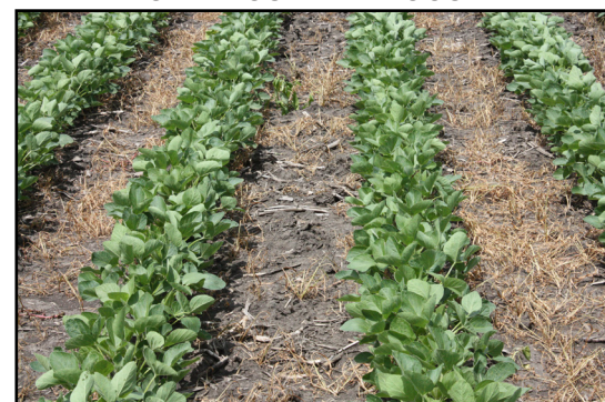
GLUFOSINATE + BOOST