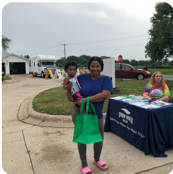
Greenbriar Apartments Health Fair!

Greenbriar Apartments Health Fair, Hanging out in the community room at Prairieview Townhomes, Eisenhower Tower's Resident Appreciation Day, Residents helping to maintain flowers on property!