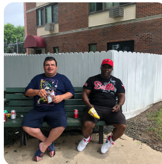
Eisenhower Tower Resident Appreciation Day