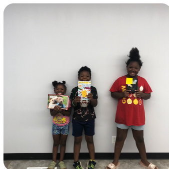
Community Room Hangouts at Prairieview Townhomes