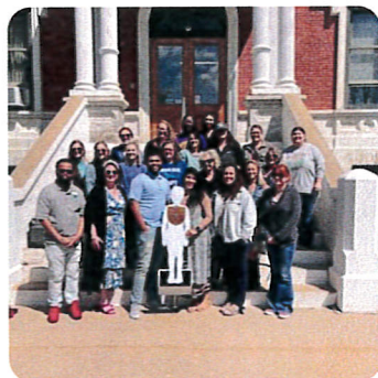
HAMC staff attend Hands Around the Courthouse for Child Abuse Awareness