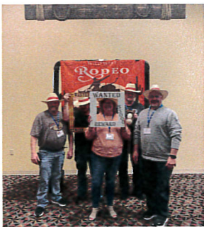
Executive Director and Maintenance staff attend annual conference!

Staff attends the Annual Conference in Springfield, Il. Staff participates in the Hands Across the Courthouse for child abuse awareness, Staff helps with the annual BBBS flower show.