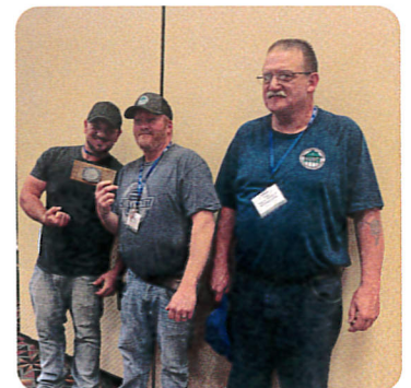
Maintenance Olympics Winners at the Maintenance and Management Clinic. GO HAMC!