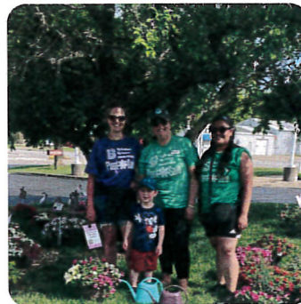
Finance Director helping with the BBBS plant sale!