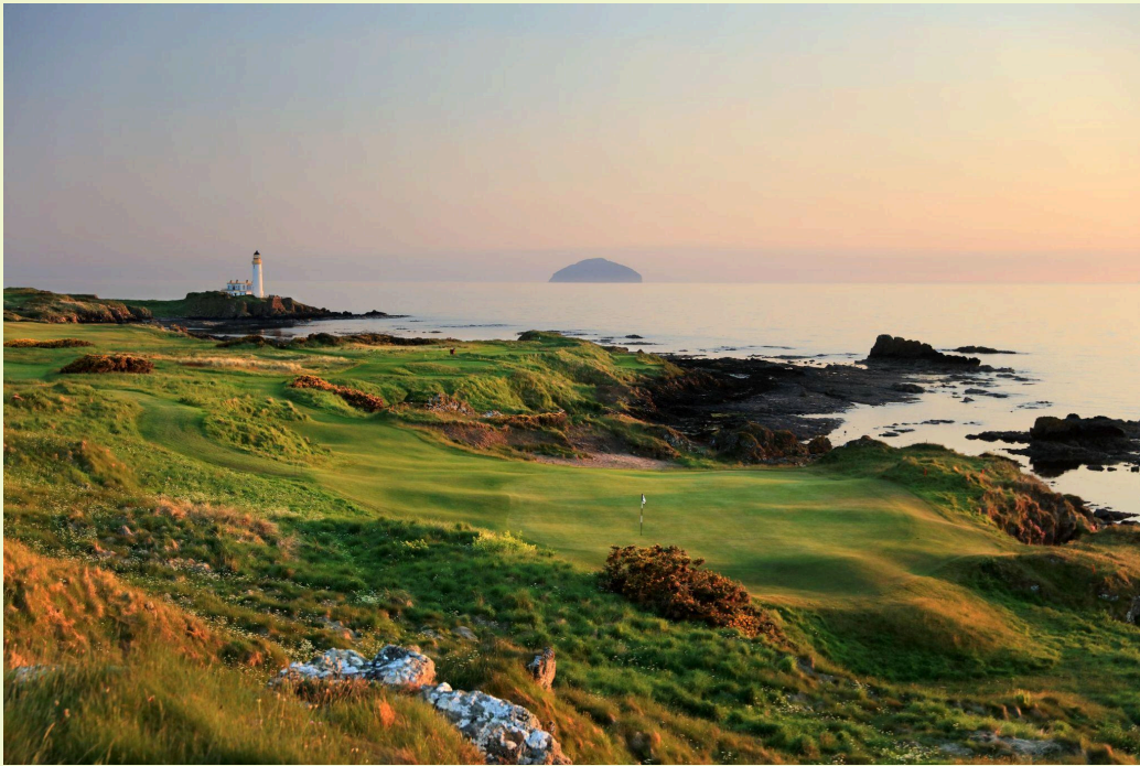
Trump Turnberry, Ailsa Course

Four exceptional Open Championships have graced the prestigious Ailsa course, including the unforgettable 1977 'Duel in the Sun' - an epic battle of wits and skill between Jack Nicklaus and Tom Watson that remains etched in the minds of golfers worldwide. Surrounded by stunning coastal scenery, navigate the same dramatic landscapes that have challenged the greatest as you experience the true spirit and traditions that make Scotland the unrivaled 'Home of Golf'.