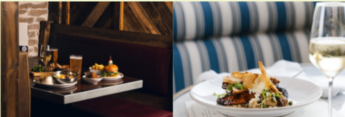
Dinner Options at the Rusacks Hotel

been played at the Links since the 16th century. The Championship Course has hosted eight Open Championships, two Women's Open and two Seniors Open making it one of the very few to have done so in the United Kingdom. It is one of three courses used for the annual Dunhill Links and in 2018 The Open Championship returned to the course. In 2018, the Championship Course was voted Best Golf Course in Scotland over £100 by the general public, the second time it has won the award in the past three years. Dinner at the Rusacks Hotel or one of the many pubs and restaurants in St. Andrews.