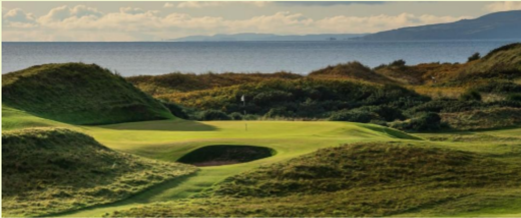
Royal Troon Golf Club

After breakfast at the Marine Troon Hotel, depart for Royal Troon Golf Club, host of the 2024 Open Championship. Just prior to Royal Troon hosting its first Open Championship in 1923, the course was redesigned by legendary course architect and five-time Open