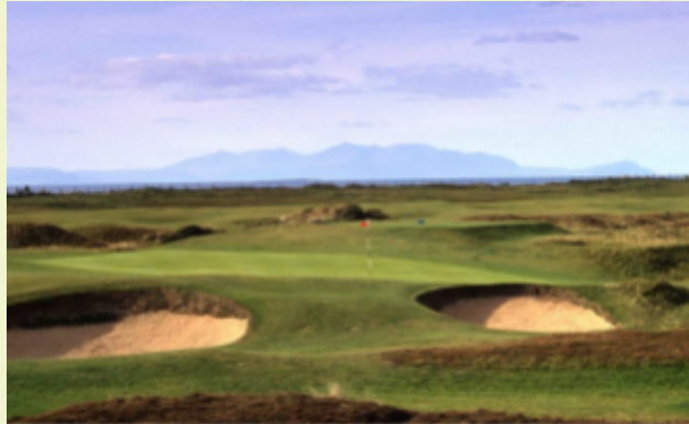
Prestwick Golf Club

After breakfast at the Marine Troon Hotel, depart for Prestwick. Prestwick Golf Club was formed in 1851 and is the birthplace of Open Championship golf.