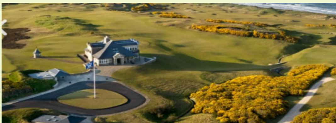
Kingsbarns Golf Links