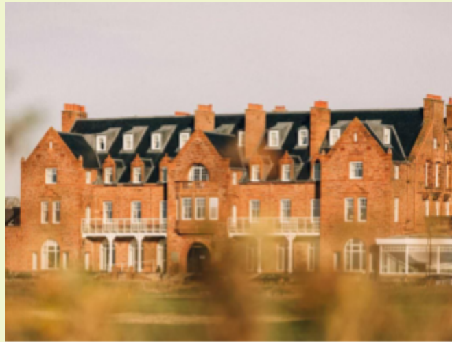
Marine Troon Hotel

Depending on the outcome of the Old Course lottery on Day 2, Day 4 is a back-up day to play the Old Course at St Andrews. After breakfast at the Rusacks Hotel either play the Old Course or depart directly for Troon. Check into the Marine Troon Hotel, a 5-star