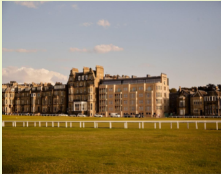
Rusacks Hotel-Old Course St. Andrews

Fly to Edinburgh, Scotland. Arrive Edinburgh in the morning. Meet your driver at the airport and proceed to St. Andrews via chauffeured coach. Check into Rusacks Hotel, a landmark hotel in