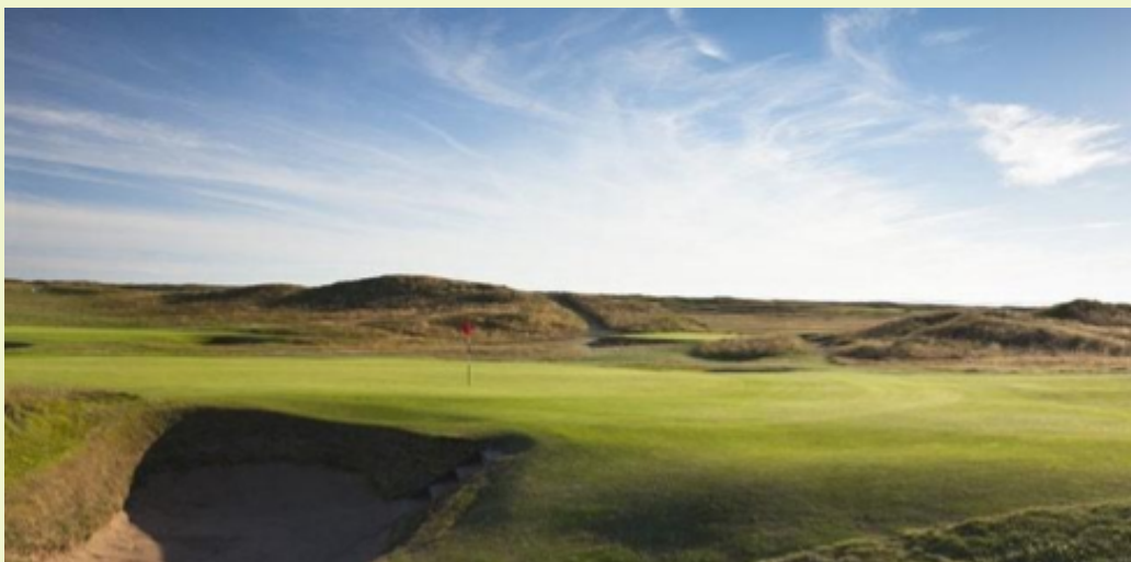
Prestwick Golf Club

Prestwick Golf Club was founded when the 13th Earl of Eglinton was elected as its first Captain. Old Tom Morris was recruited to be Keeper of the Green, Ball and Clubmaker at Prestwick and served Prestwick until 1864 when he returned to his native St Andrews. In his 13 years at the club, Old Tom Morris helped establish one of golf's most famous events, The Open Championship in 1860, which he himself won four times. After a morning round at Prestwick, the group will enjoy a three-course "late lunch" in the members' dining room. Coat and tie are required for this memorable experience at Prestwick Golf Club!