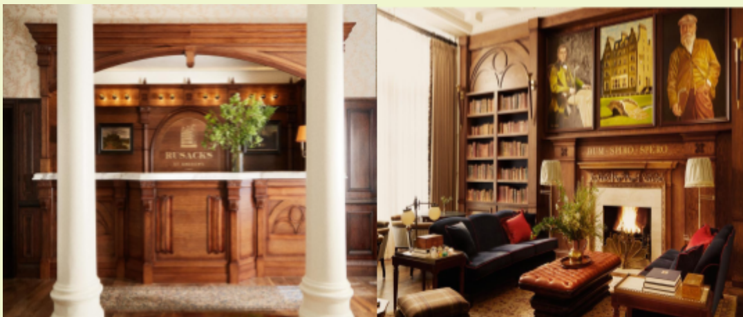
Rusacks Hotel, St Andrews

the heart of St Andrews overlooking The Old Course and Swilcan Bridge. Sign-up for the Old Course ballot for Day 2 (Heather & Gorse will do this for you) and play New Course in the afternoon. Dinner at the iconic Rusacks Hotel with its award-winning dining and its stunning rooftop restaurant and bar. After dinner—sleep!