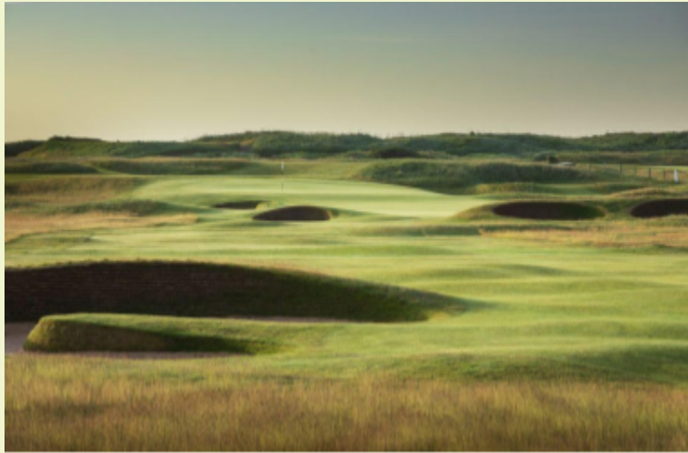
Carnoustie Golf Links

After breakfast at the Rusacks Hotel, depart for Carnoustie Golf Links. Carnoustie Golf Links is an iconic, world-leading golf destination in Scotland. Golf has