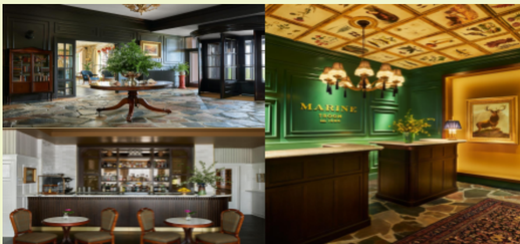
Marine Troon Hotel

accommodation with unobstructed views of the breath-taking Ayrshire (West) coastline, the Isle of Arran and the legendary Royal Troon Golf Club, a ten-time host of The Open. For dinner at the Marine Troon Hotel, enjoy views of Royal Troon golf course and the coast while experiencing the best of Scottish and British cuisine, with menus that champion in-season ingredients, local produce, and game and seafood.