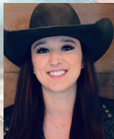
BCTPA Aspen Ledger