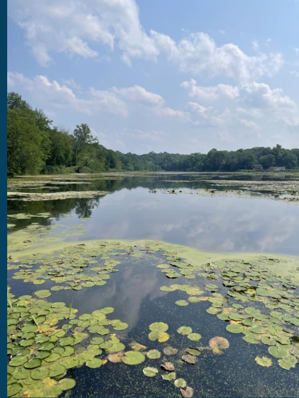
One Week After First Treatment