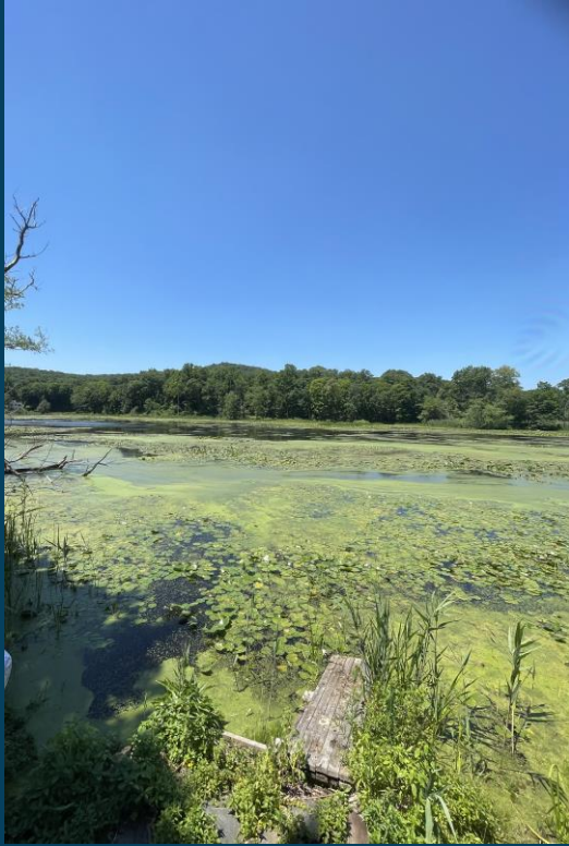
Right Before Initial Treatment