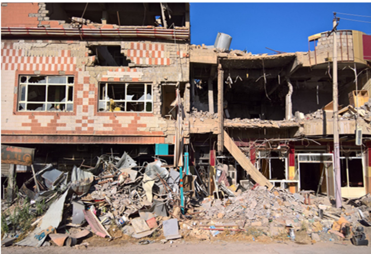
Lutheran Disaster Response

This month we are thankful and filled with gratitude for Staff and Volunteers of the Synod, ELCA, Lutheran Disaster Response and World Hunger