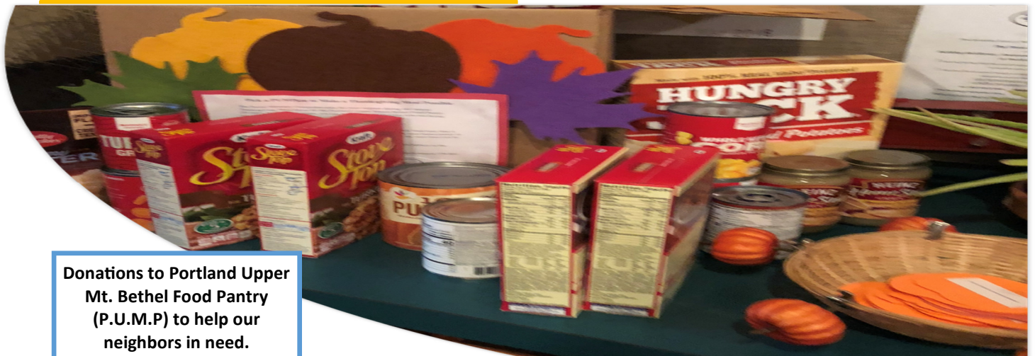
Donations to Portland Upper Mt. Bethel Food Pantry (P.U.M.P) to help our neighbors in need.