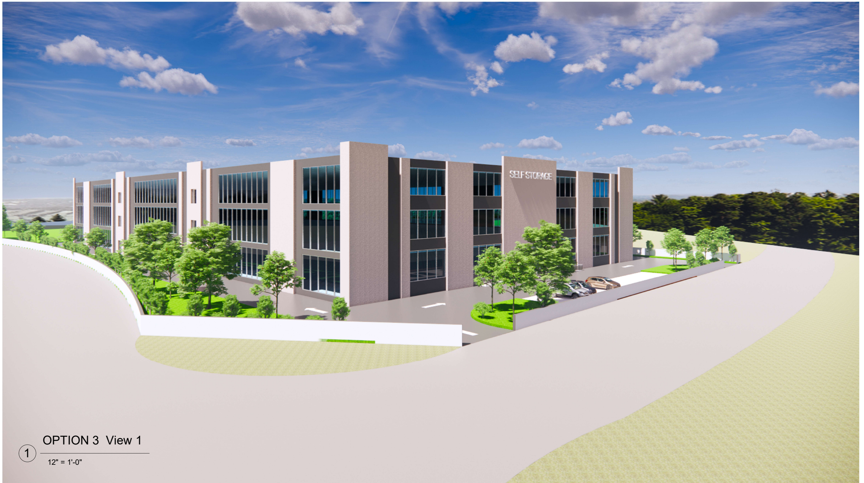
1 OPTION 3 View 1 12" = 1'-0"

Project Name: Proposed Self Storage at Jacksonville Road in Burlington, NJ