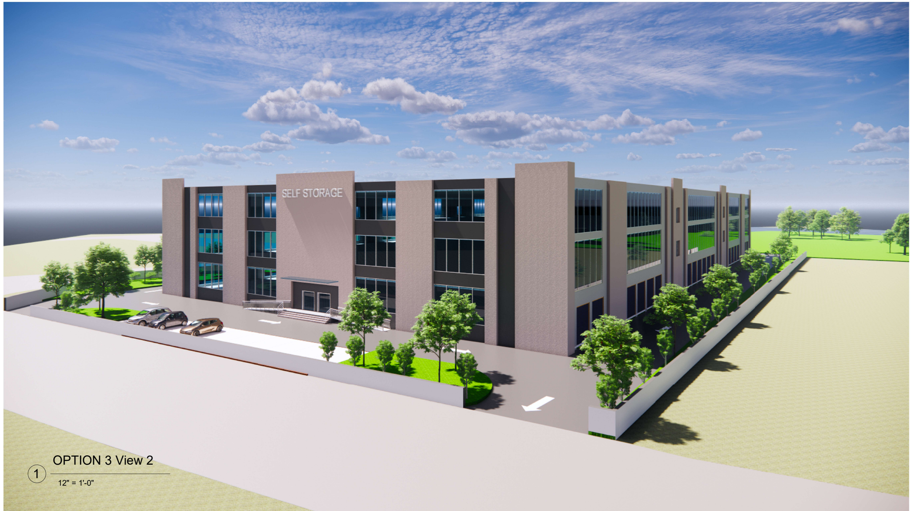
1 OPTION 3 View 2 12" = 1'-0"

Project Name: Proposed Self Storage at Jacksonville Road in Burlington, NJ