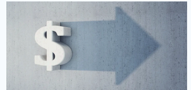
Index Universal Life