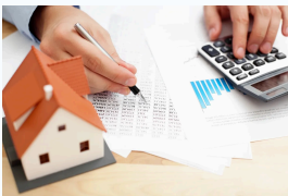
Final Expense (FEX)

At Infinite Insurance Group we pride ourselves on being a versatile life insurance agency, ready to cater to families with a comprehensive range of coverage options tailored to their individual needs.