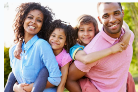
Term Life Insurance